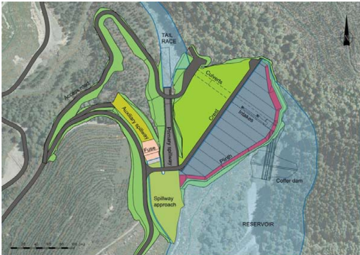
Dam layout details at site.

Putting a dollar value on a natural resource such as water is a very complex issue. Irrigators already pay to obtain water permits and will continue to do so, although those costs will most likely change to fund the proposed dam. Urban and industrial users also already pay. Who should pay for the portion of the cost of the dam that will meet environmental needs is yet to be resolved. WWAC is investigating every opportunity to seek central government support for this project and is looking at a range of funding methods as part of its ongoing investigations.