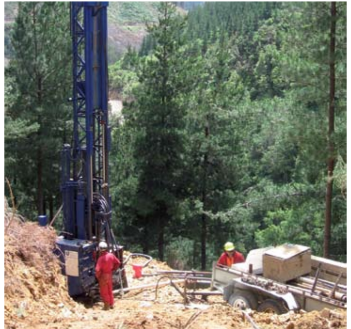
Site investigations – drilling and testing foundation rock on the dam abutment.

www.tasman.govt.nz/index.php?WaterforWaimeaBasin