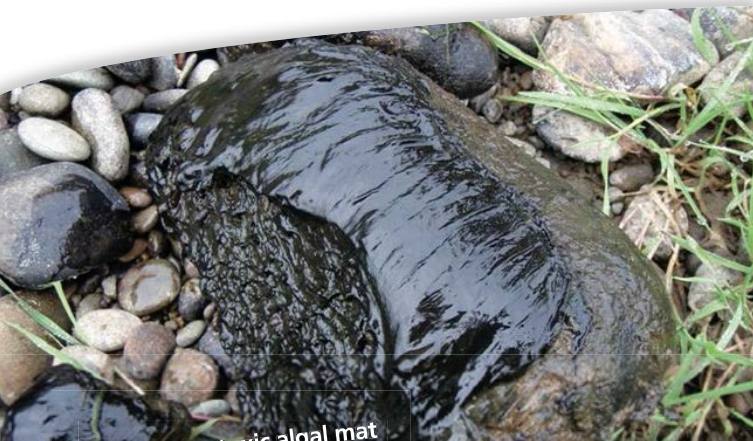
Dark brown toxic algal mat

Toxic algal mats are actually dark brown or black and grow attached to rocks on the river bed. Mats that come loose from the river bed can wash up on the river bank or form floating 'rafts' in shallow areas. Where exposed, the mats may dry out and turn a light brown colour. They also have a strong musty odour, which may attract dogs to eat them.