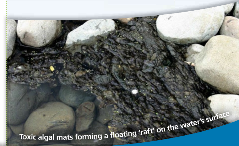
Toxic algal mats forming a floating 'raft' on the water's surface