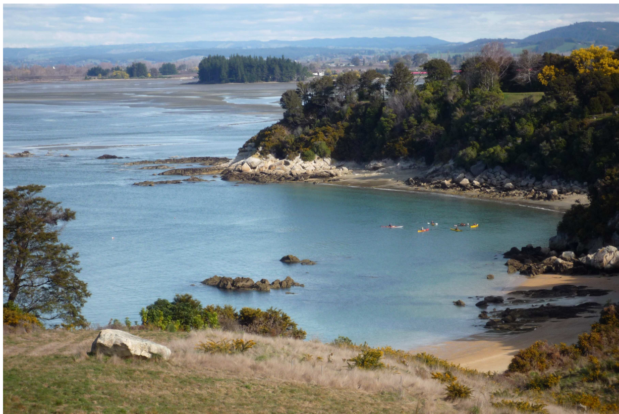
Stephens Bay, Kaiteriteri