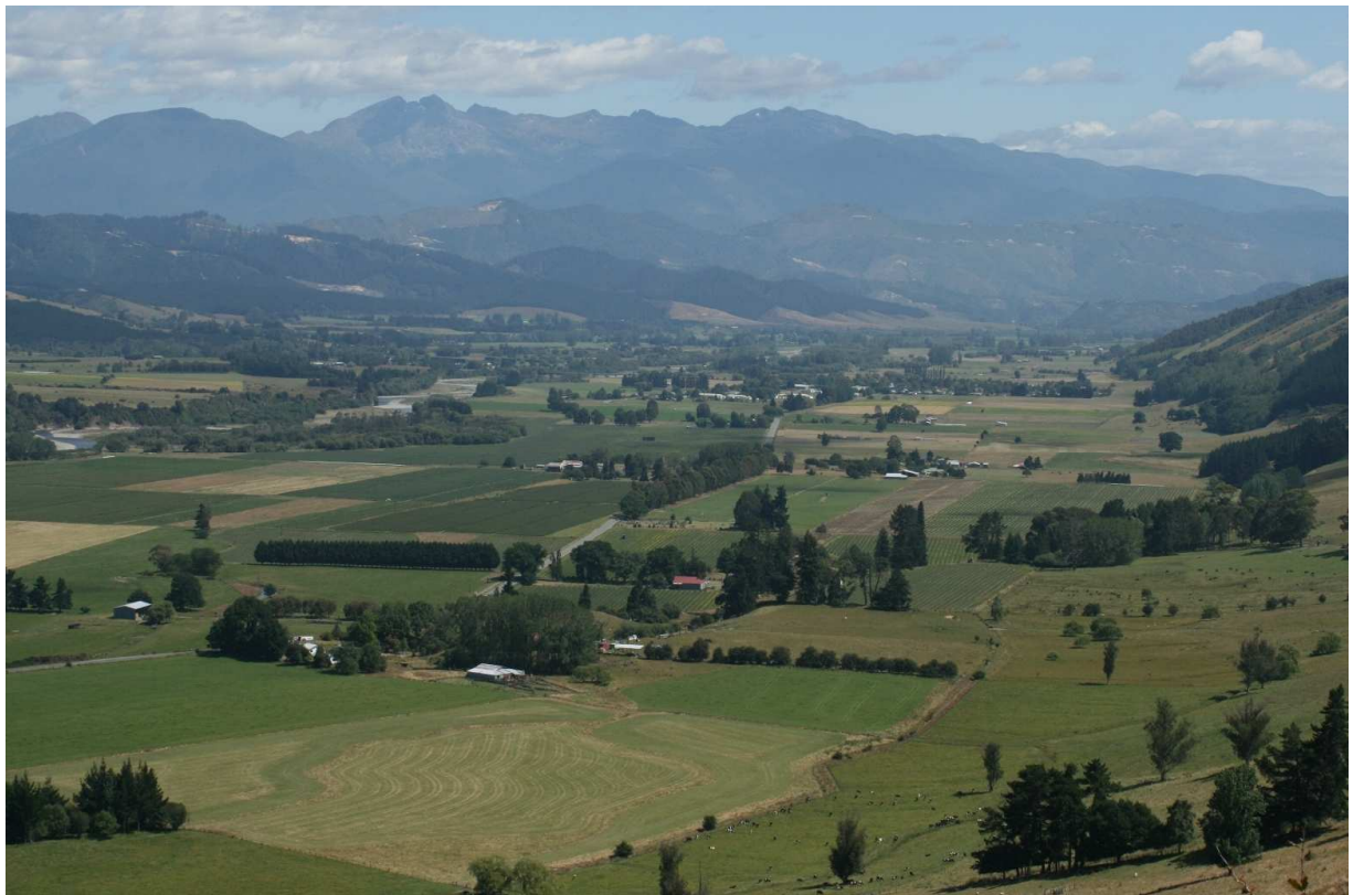
Motueka Valley and Tapawera