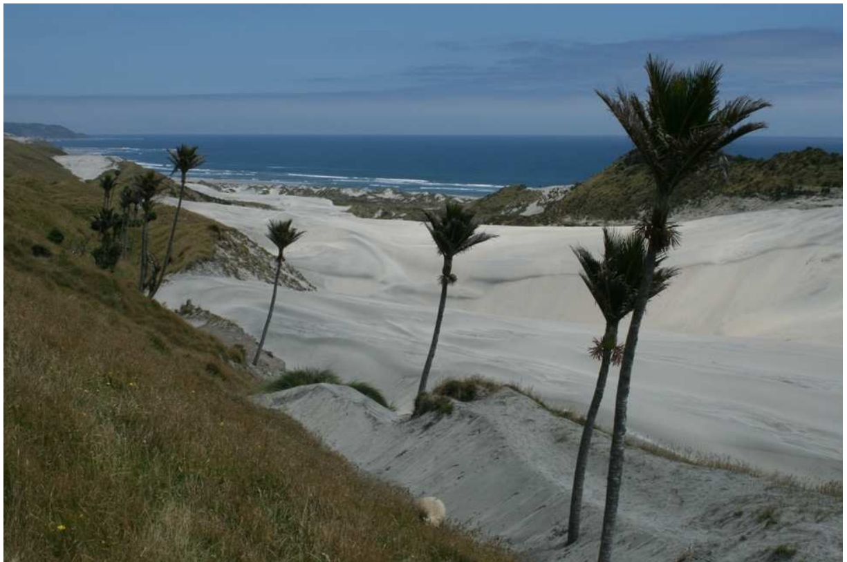
Turimawiri sandhills, Golden Bay