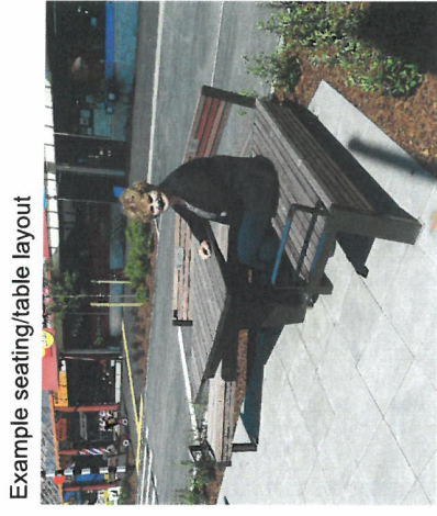
Example seating/table layout