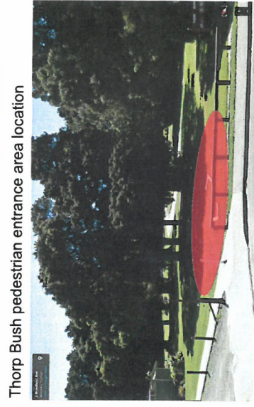
Thorp Bush pedestrian entrance area location