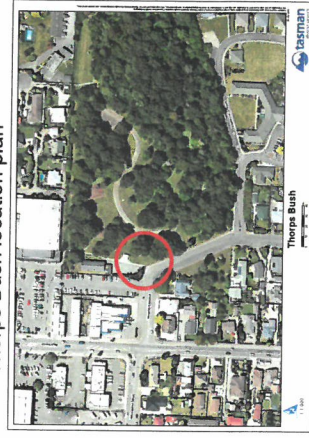
Thorps Bush location plan

Date: 21/5/2019 Scale 1:00 @ A3 Drawn: Stephen Richards Sheet 2 of 2 Contact: Lani Evans Lynne Hall All dimensions in millimetres