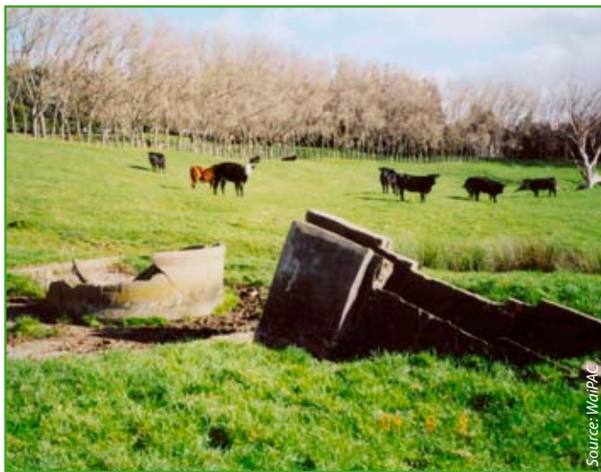
Outline of former plunge dip

Regional Councils are able to apply for Government funding to assist with the remediation of contaminated land, which will provide part of the costs if an application is successful.