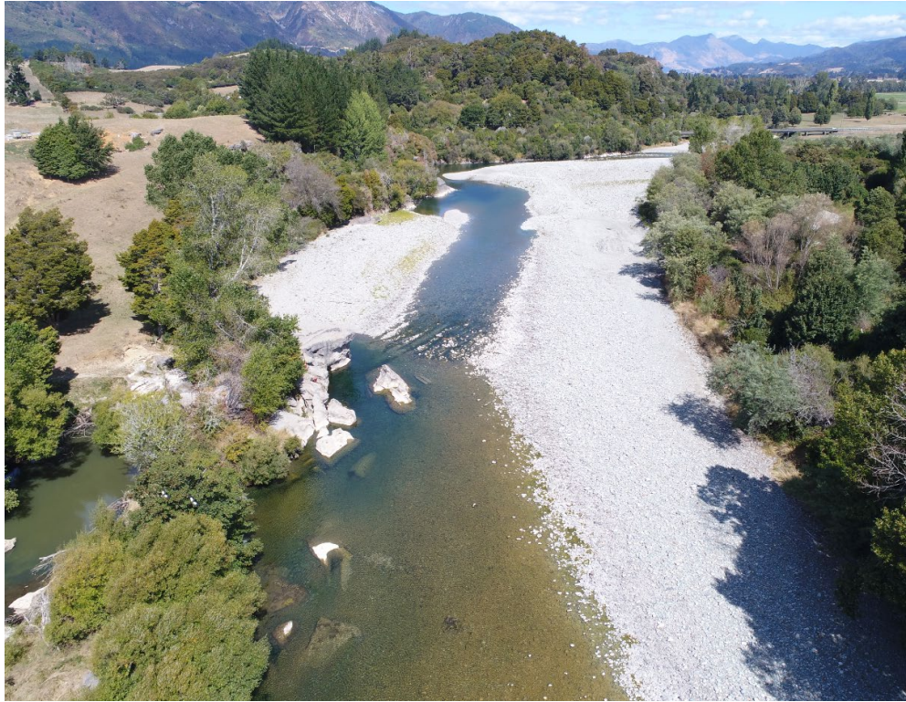
Top Rocks 1