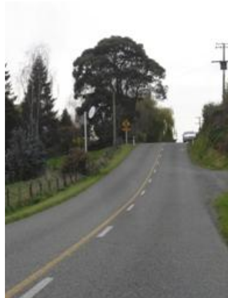
Paton Rd – Isolated vertical curve between White and Ranzau Roads. Propose to lower crest to provide safe sight lines