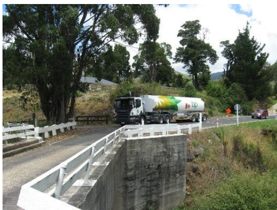
Black Bridge (Single Lane) – Motueka Valley Highway (800vehicles per day)