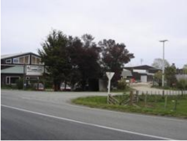
Wilson Road/Moutere Highway – High truck numbers entering and leaving saw-mill