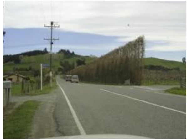
Waimea West Road/Palmer Road Intersection. Similar problem to intersections above. Localised seal widening to allow through traffic to pass. Note proximity of pole to traffic lane.