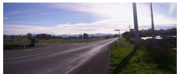
Swamp Road/Queen Street Intersection – Turning traffic obstructs through traffic (7000 vpd)