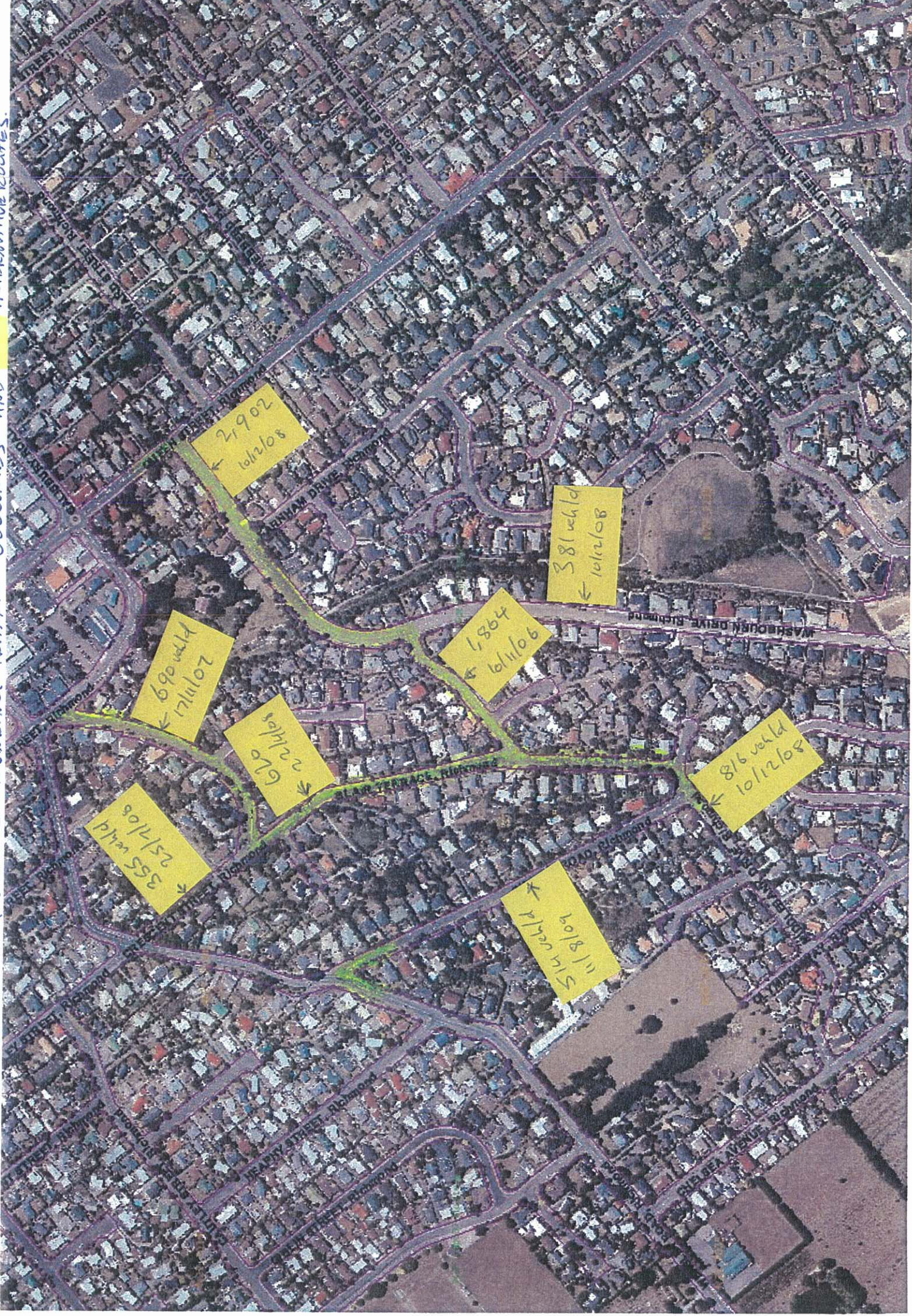
DIAGRAM 2 - SURROUNDING TRAFFIC VOLUMES AND ALTERNATIVE ROUTES.