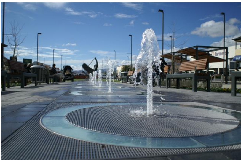
Sundial Square Richmond

The aim of the urban design action plan is to improve awareness of and implement sound urban design throughout the district. A quality built environment will complement the unique natural environment of our district.