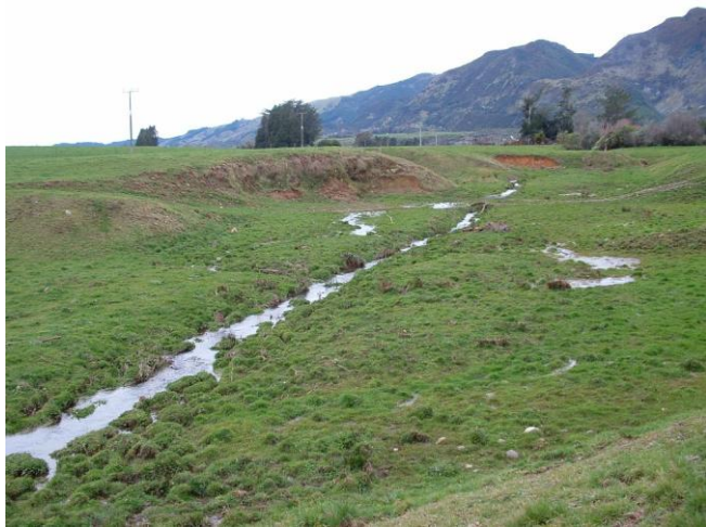
Figure 1a: Berkett Creek downstream of the wooded section (average width 0.6 metres)