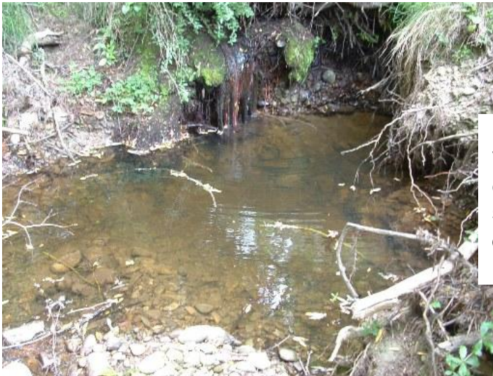
Figure 11: A pool in Redwood Valley Stream. Pools like this contain water even when the stream stops flowing, providing essential refuges for fish.

Many intermittently-flowing streams in Moutere gravel country were found to contain reasonable numbers of fish (particularly banded kokopu, a species sensitive to habitat disturbance). The presence of residual pools shaded by riparian trees is thought to be the reason for the numbers of these sensitive native fish found in this survey. These residual pools are formed in the parent Moutere Gravel sequences rather than re-worked eroded gravels. This type of habitat was found in this survey at Redwood Valley Stream, Seaton Valley Stream, Tasman Valley Stream and Horton Valley Stream and has also been found in Eves Valley Stream. It will be interesting to re-survey this site, and other additional sites like it, in summer to confirm that the pools contain water when the flow has ceased. If this is the case it would be very important to protect these types of streams from disturbance, including direct modification with machinery or from significant erosion caused by increased peak flow run-off from removal of large areas of vegetation in the catchment, as has been experienced in Eves Valley Stream.