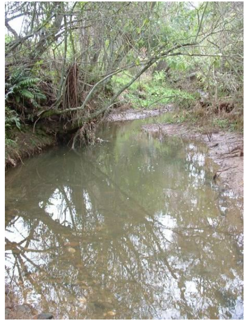
Figure 1b: Berkett Creek within the wooded section (average width 1 metre)

Figure 2 below shows an example of results from a catchment that is included in the full report on this investigation.