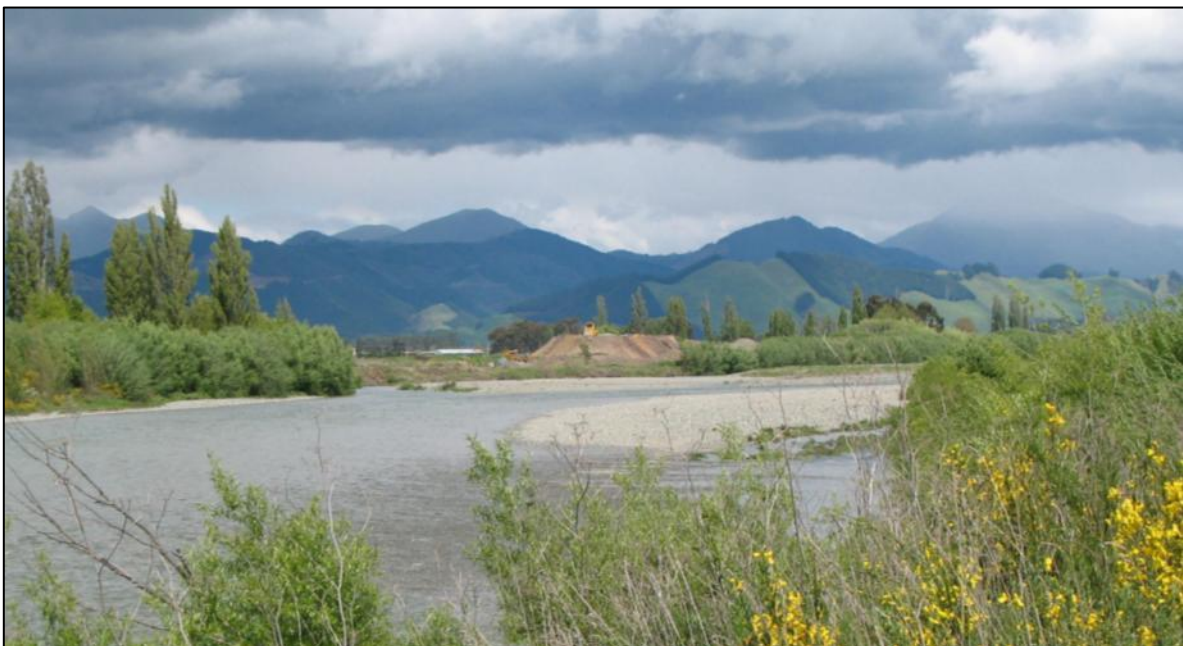
Stock pile at gravel-processing plant