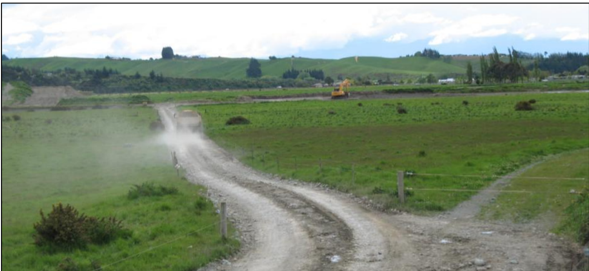
Gravel extraction from a site adjacent to Waimea River Park

The historic supply of gravel from the Waimea River and proximity to markets has prompted the construction of gravel processing plants on the berm lands. There are three gravel-processing leases, all on the east bank of the river. These leases comprise large rock-crushing plants, stockpiles of gravel and rock, and ancillary structures such as fences and buildings. The plants process gravel from the berm lands and nearby private land, and from quarries elsewhere in the District. Rock-processing plants and stockpiles within the stop banks are not compatible with the maintenance of an open river floodway.