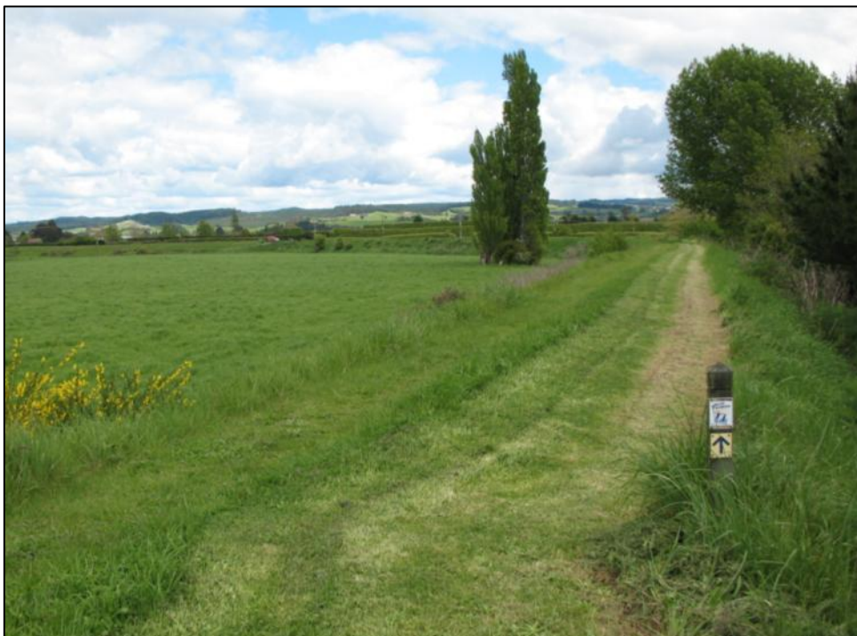
Waimea River Walkway near Appleby Bridge