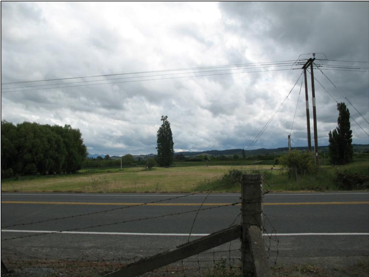
Electricity transmission lines at Appleby Bridge