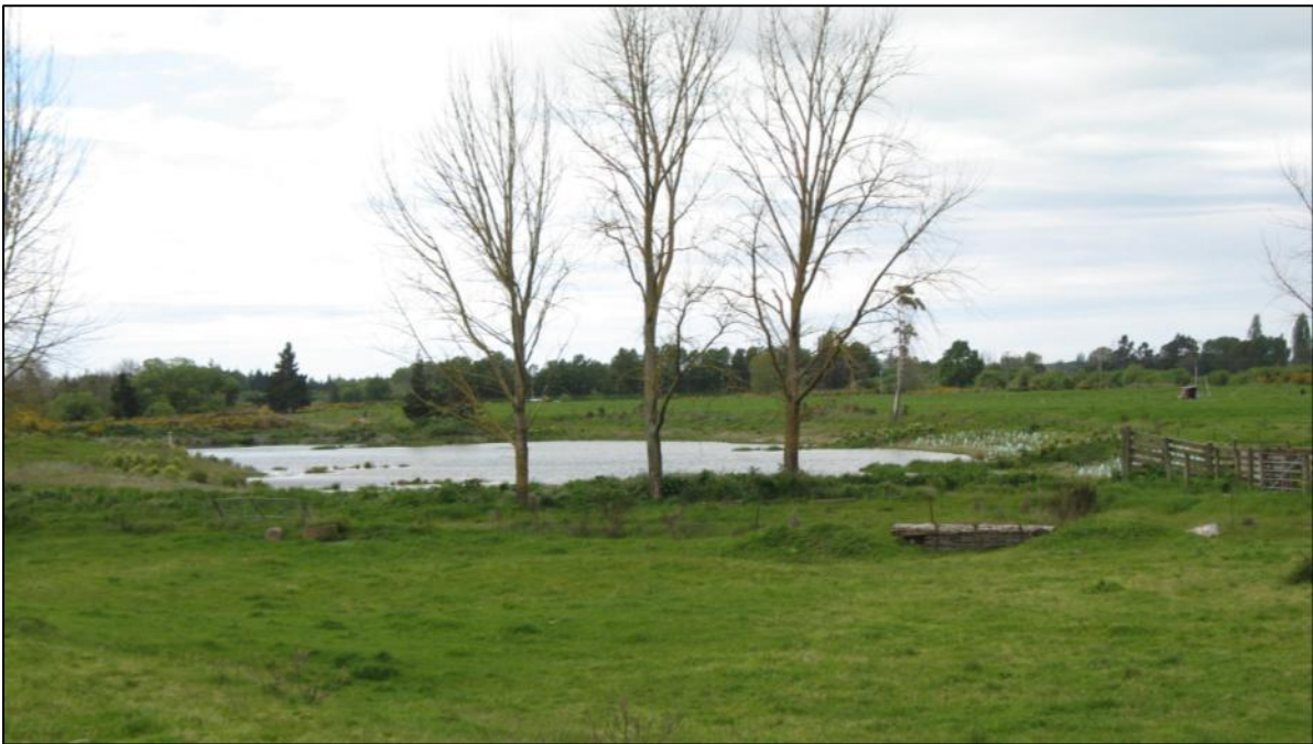
Habitat restoration at Challies Island back-channel

Nelson/Marlborough Fish and Game Council has suggested that small shelters be constructed on the stop bank at Challies Island for use as maimais during the game-bird hunting season and for use as bird-watching hides at other times. Another request received during the preparation of this draft management plan is the provision of a stocked fish pond and facilities at Challies Island to be managed as a put-and-take fishery for introducing young people to recreational fishing. This proposal would be developed in consultation with Nelson/Marlborough Fish and Game Council.