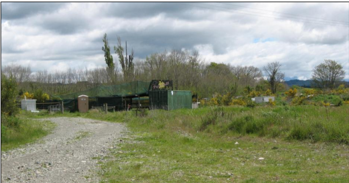
Existing paintball operation at Challies Island

A commercial paintball operation, depending on its location, need not conflict with other objectives for park management. However, it does require exclusive use of land, similar to other commercial leases, and a 40 m buffer (or some other screening) between it and other uses. This management plan proposes that the commercial paintball lease be relocated from Challies Island. One possible location is the pine plantations north of Challies Island, where the pine trees are in poor condition and proposed for removal.