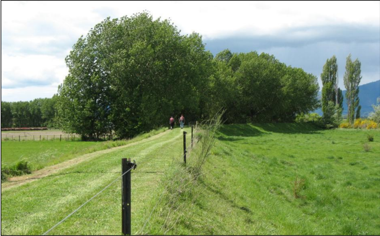
Walkers on Waimea River Walkway near the Challies Island back-channel

The berm lands, especially the undeveloped parts, provide opportunities for hunting pheasant, California quail and other game birds. This area provides the best pheasant hunting resource in the region and one of the best in the South Island 16 . Game bird hunting and associated activities are popular though largely seasonal uses of the berm lands. Nelson/Marlborough Fish and Game Council has enhanced habitat for game birds on some parts of the berm lands. The area is one of the few accessible areas of public land close to Nelson that is available for hunting.