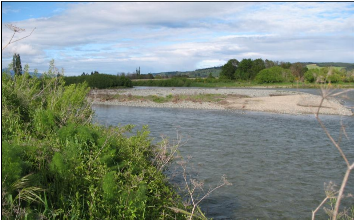
River bed at the confluence of the Wairoa and Wai-iti rivers