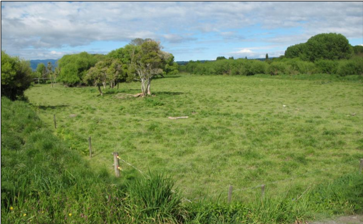
A typical area of berm land leased for grazing

also see River Control and Soil Conservation Policies (section 6) and Commercial Use Policies (section 10)