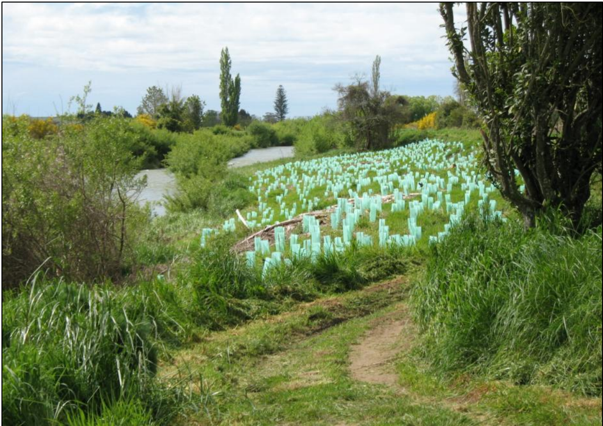
Recent planting on the bank of Wai-iti River alongside Two Rivers Walkway