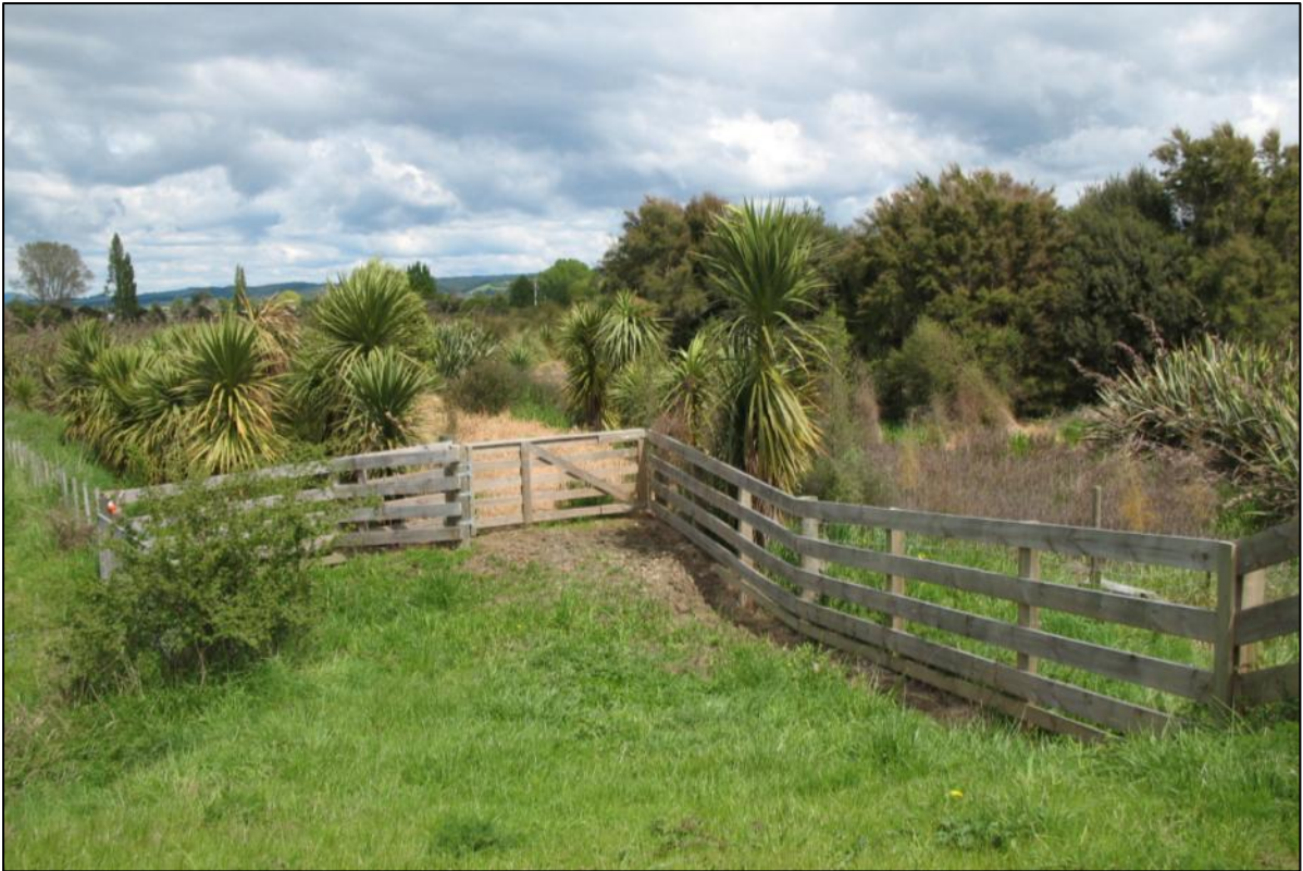
An example of restoration plantings at Pearl Creek, adjacent to Waimea River Park

One area adjacent to the park, in and around Pearl Creek near where the river enters the estuary, has been protected and vegetation has been restored to protect native fish habitat. More recently, commercial extraction of gravel from an abandoned channel of the river at Challies Island has been used to create wildlife habitat and opportunities for game-bird hunting. Ponds have been created and vegetation established as part of this wetland restoration project. Some predator trapping has been undertaken in the park by the Animal Health Board and local bird enthusiasts. There is considerable potential for the creation of further areas of wildlife habitat and restoration of indigenous plant communities.