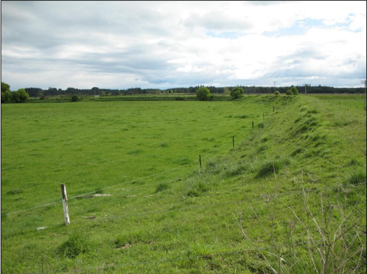
Stop bank and berm lands leased for grazing

Construction of stop banks and extraction of gravel have altered the hydrological character of the river, replaced riparian plant communities, modified in-stream and riparian wildlife habitat and changed the natural character and aesthetic appeal of the river and its margins. These works have also created vehicle tracks on both sides of the river that provide access for recreation, encouraged the growth of areas of naturalised vegetation that provide habitat for game birds, and enabled river works for other activities.