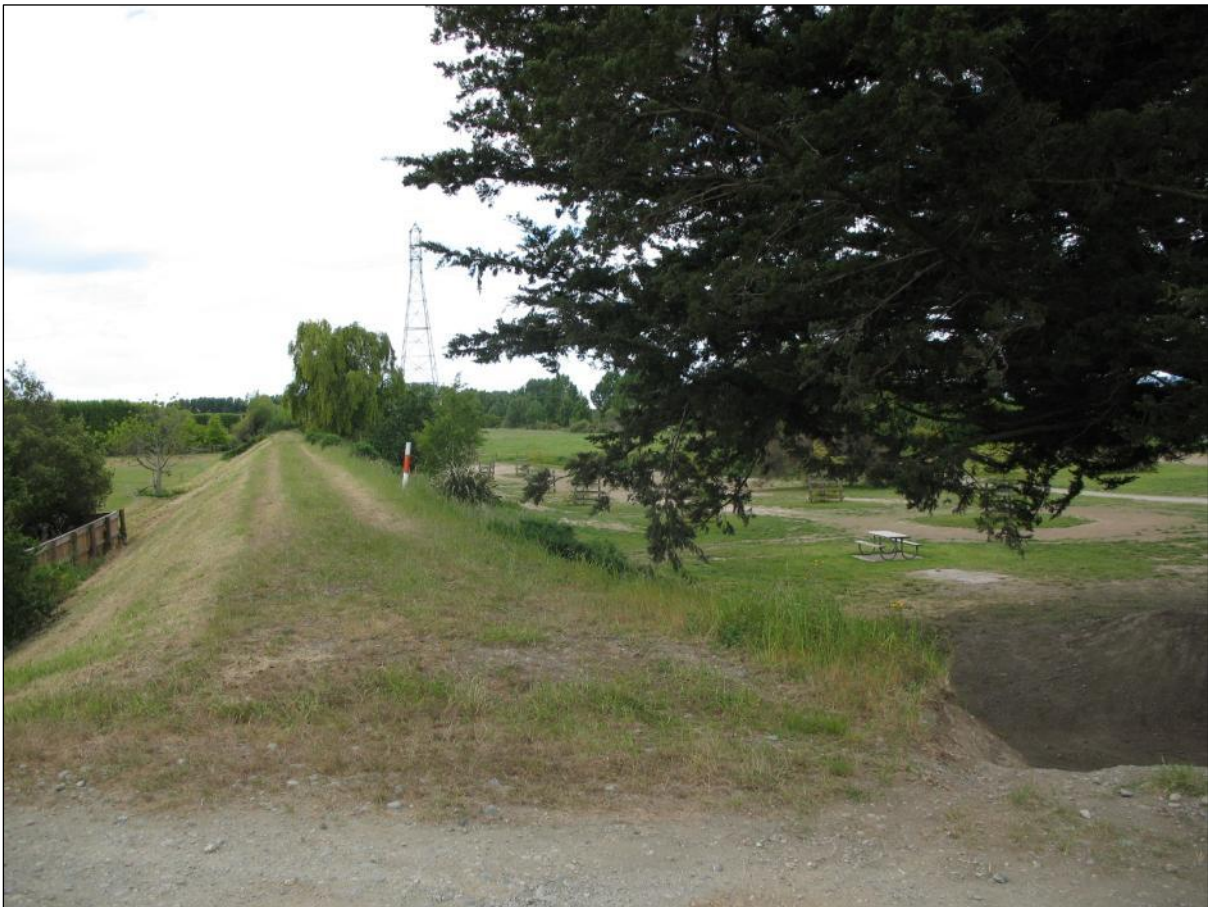
Picnic facilities at Appleby Bridge

also see Toilet and Water Facilities Policies (section 9.7)