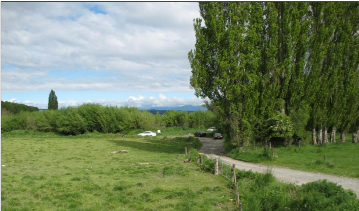
Motor vehicle parking at Lower Queen Street

Motor vehicle use has encouraged misuse and vandalism in the park, notably dumping of garden waste and rubbish (including vehicles) and destruction of facilities such as the picnic area at Appleby Bridge. A substantial majority of public submissions received during the preparation of this draft management plan are opposed to continued motor vehicle access within the park. This management plan proposes that unauthorized motor vehicle use will be progressively phased out as car parks and other facilities are established at key access points at park boundaries. Motor vehicle access and some roads will be maintained within the park for management purposes and where required by existing lessees.