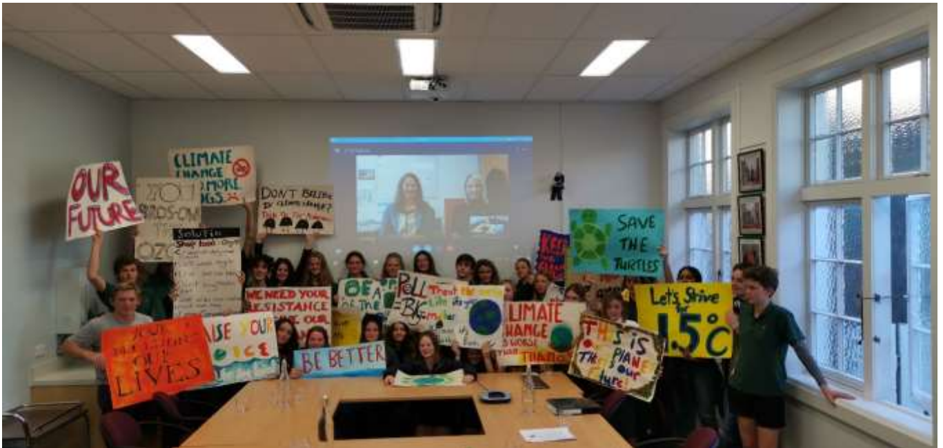
Video conference between Golden Bay High School Students and Council staff, 24 May 2019