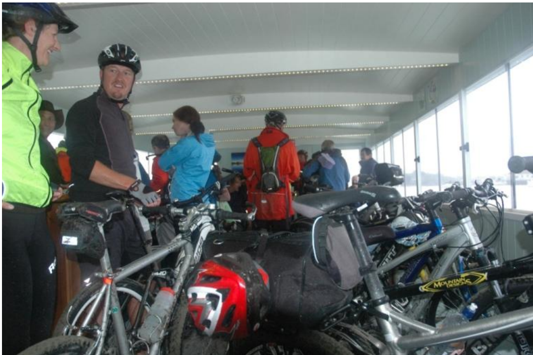
A full complement of cyclists cross the Mapua Channel in the “Fairy”