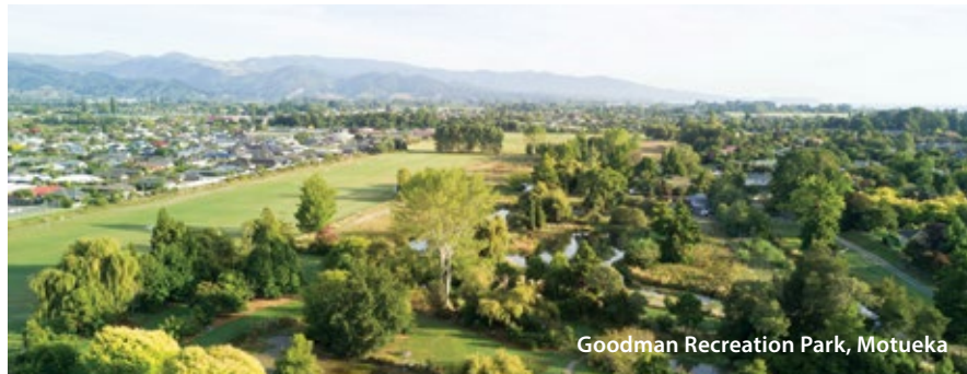
Goodman Recreation Park, Motueka

At its meeting last week, Council adopted the Annual Plan 2020/2021.