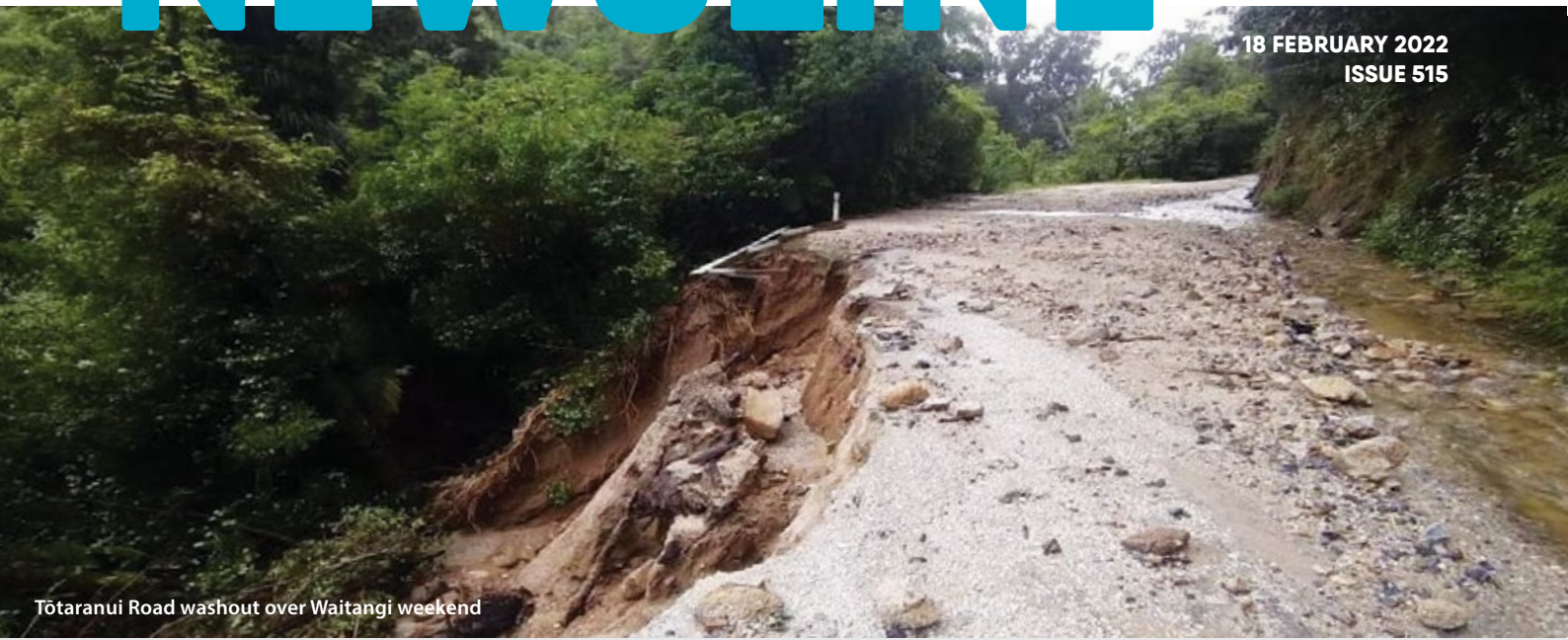
Tōtaranui Road washout over Waitangi weekend