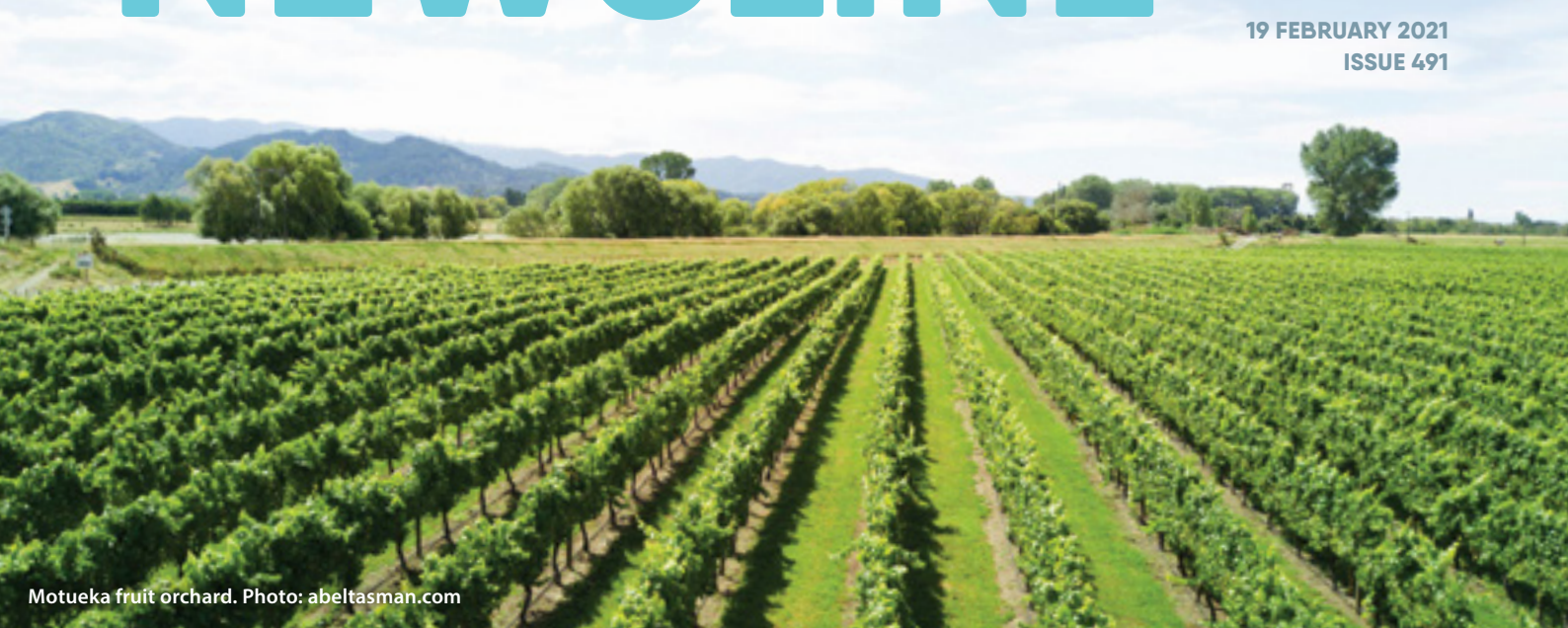
Motueka fruit orchard.