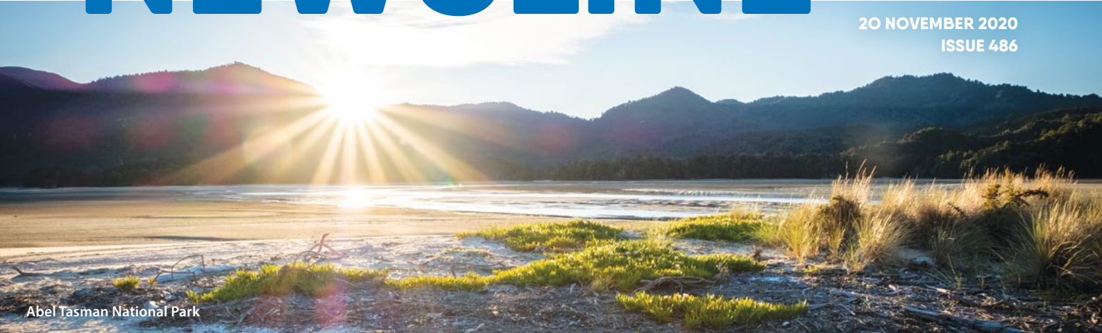
Abel Tasman National Park