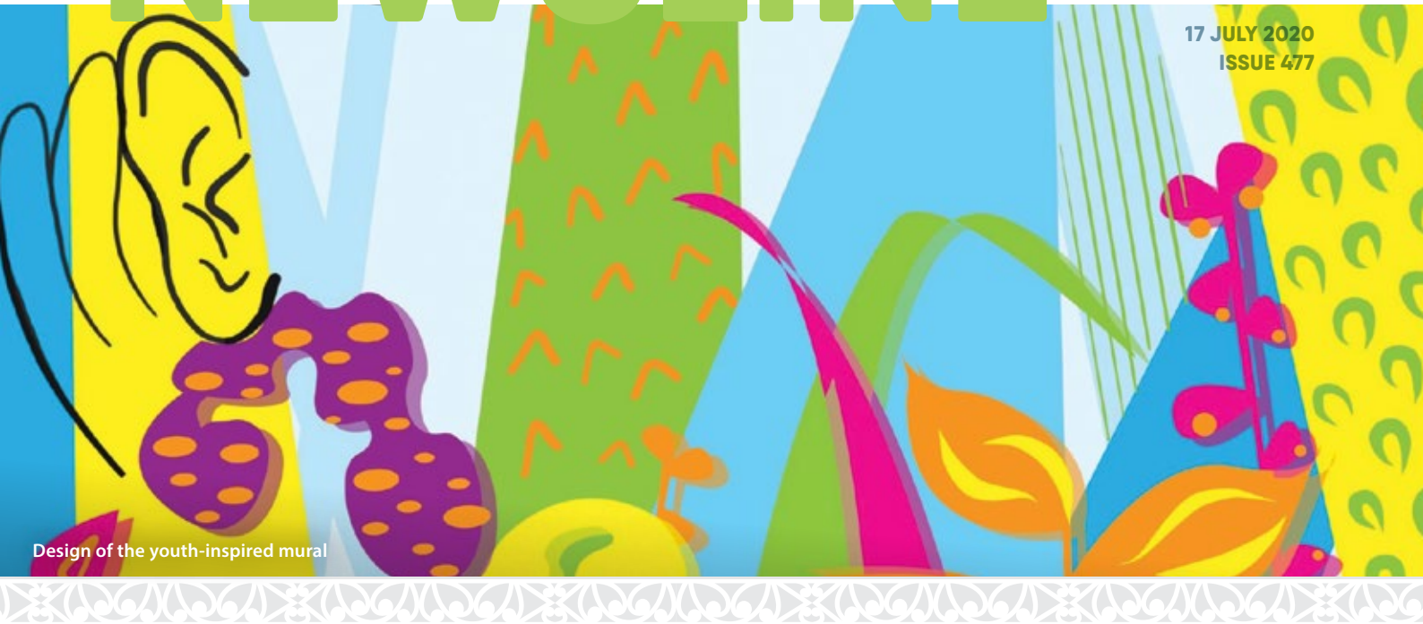
Design of the youth-inspired mural