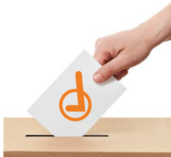
A typical FPP voting document could look like this

FPP has been used for all Tasman District Council elections up until this point. This year you have the option of voting for change because a valid public petition representing at least 5% of those on the 2016 electoral roll requested a poll on the method of voting for future elections.