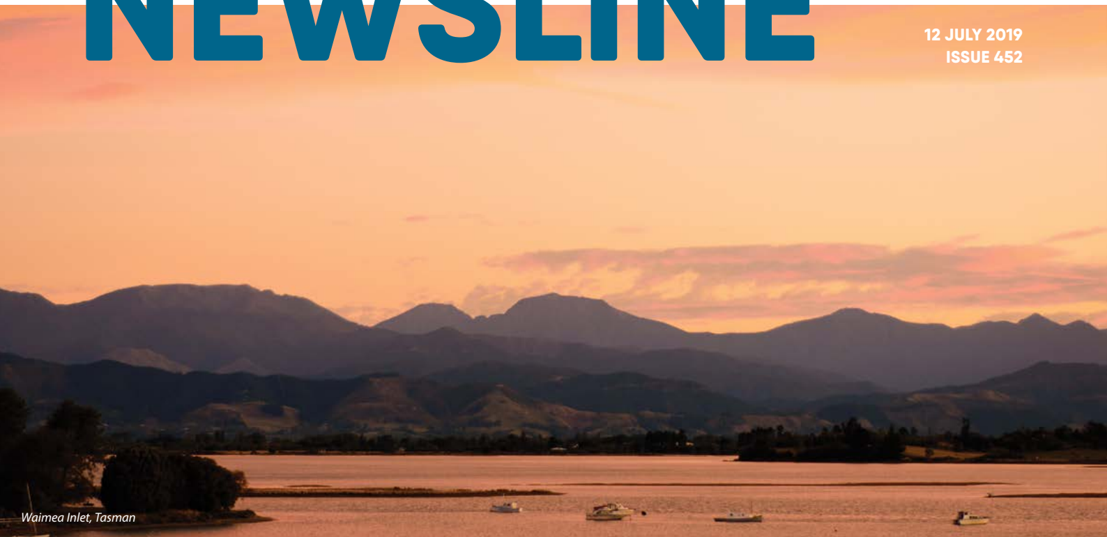
Waimea Inlet, Tasman