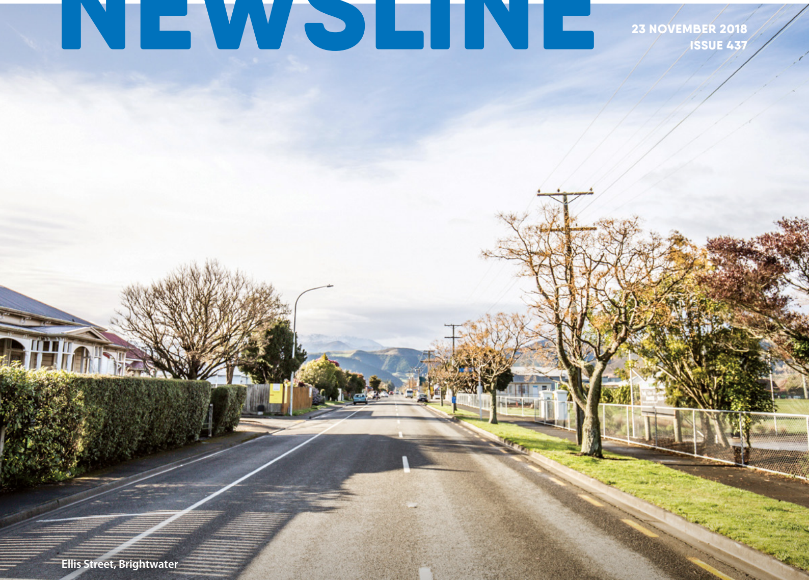
Ellis Street, Brightwater