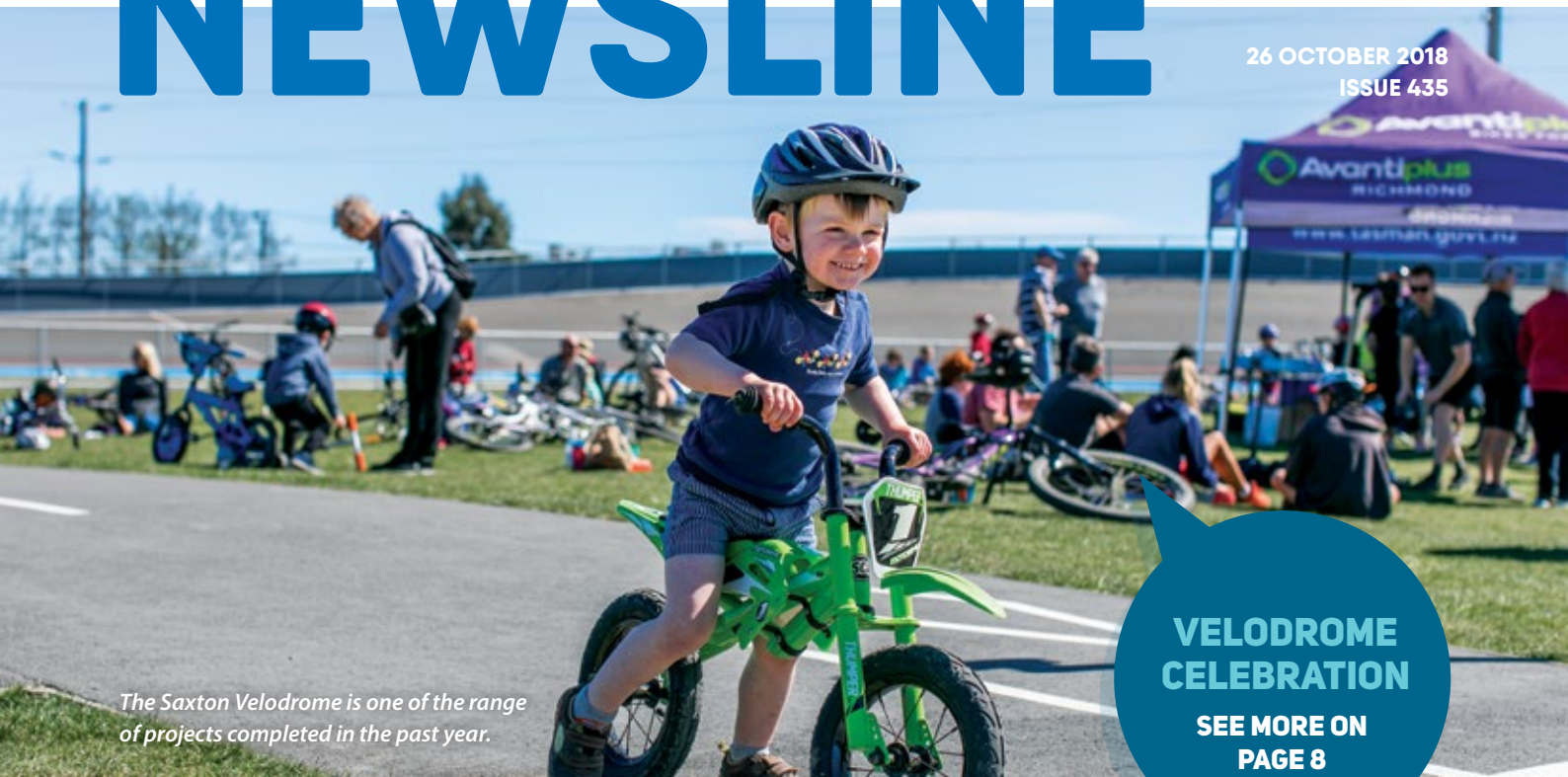
The Saxton Velodrome is one of the range of projects completed in the past year.

VELODROME CELEBRATION SEE MORE ON PAGE 8