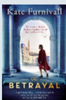
The betrayal By Kate Furnivall