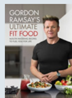
Gordon Ramsay's ultimate fit food By Gordon Ramsay