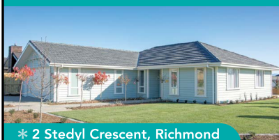
* 2 Stedyl Crescent, Richmond