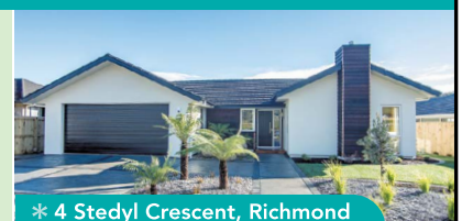
* 4 Stedyl Crescent, Richmond

* SHOWHOMES 2 & 4 Stedyl Crescent Richmond OPEN Monday to Friday 11.00am–4.00pm Saturday & Sunday 1.00pm–4.00pm