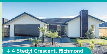
* 4 Stedyl Crescent, Richmond

2 & 4 Stedyl Crescent Richmond OPEN Monday to Friday 11.00am–4.00pm Saturday & Sunday 1.00pm–4.00pm