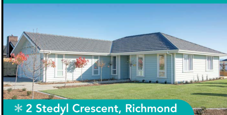
* 2 Stedyl Crescent, Richmond