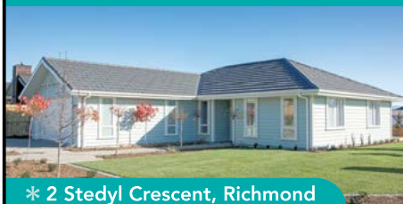
* 2 Stedyl Crescent, Richmond