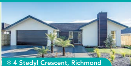
* 4 Stedyl Crescent, Richmond

2 & 4 Stedyl Crescent Richmond OPEN Monday to Friday 11.00am–4.00pm Saturday & Sunday 1.00pm–4.00pm