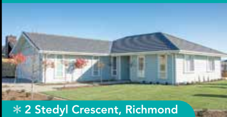
* 2 Stedyl Crescent, Richmond