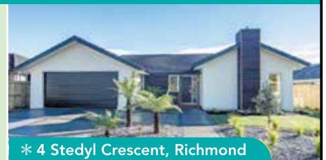
* 4 Stedyl Crescent, Richmond

2 & 4 Stedyl Crescent Richmond OPEN Monday to Friday 11.00am–4.00pm Saturday & Sunday 1.00pm–4.00pm