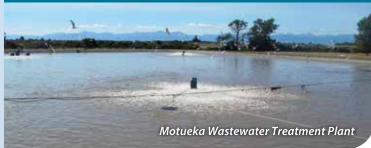
Motueka Wastewater Treatment Plant

If you are a business that discharges trade waste to the Council's wastewater network and want to know more, give us a call on Ph. 03 543 8400 or check out the information on our website www.tasman.govt.nz/link/trade-waste/