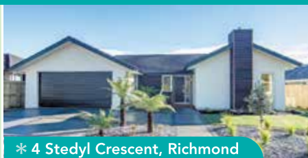
* 4 Stedyl Crescent, Richmond

2 & 4 Stedyl Crescent Richmond OPEN Monday to Friday 11.00am–4.00pm Saturday & Sunday 1.00pm–4.00pm