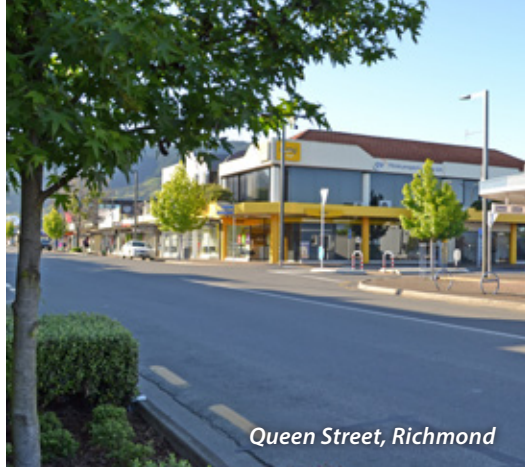
Queen Street, Richmond