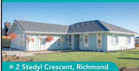
* 2 Stedyl Crescent, Richmond