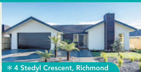
* 4 Stedyl Crescent, Richmond

2 & 4 Stedyl Crescent Richmond OPEN Monday to Friday 11.00am–4.00pm Saturday & Sunday 1.00pm–4.00pm