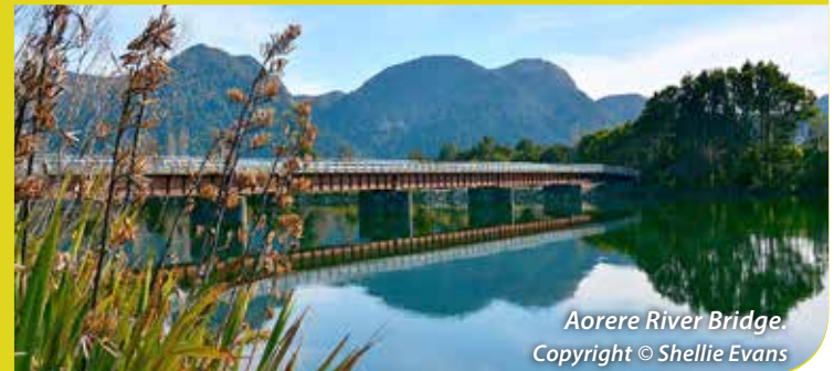
Aorere River Bridge.

Once the painting is complete, the containment and scaffolding will be carefully removed. Motorists are likely to face some delays while this work is done in late March or early April, and we appreciate your patience.