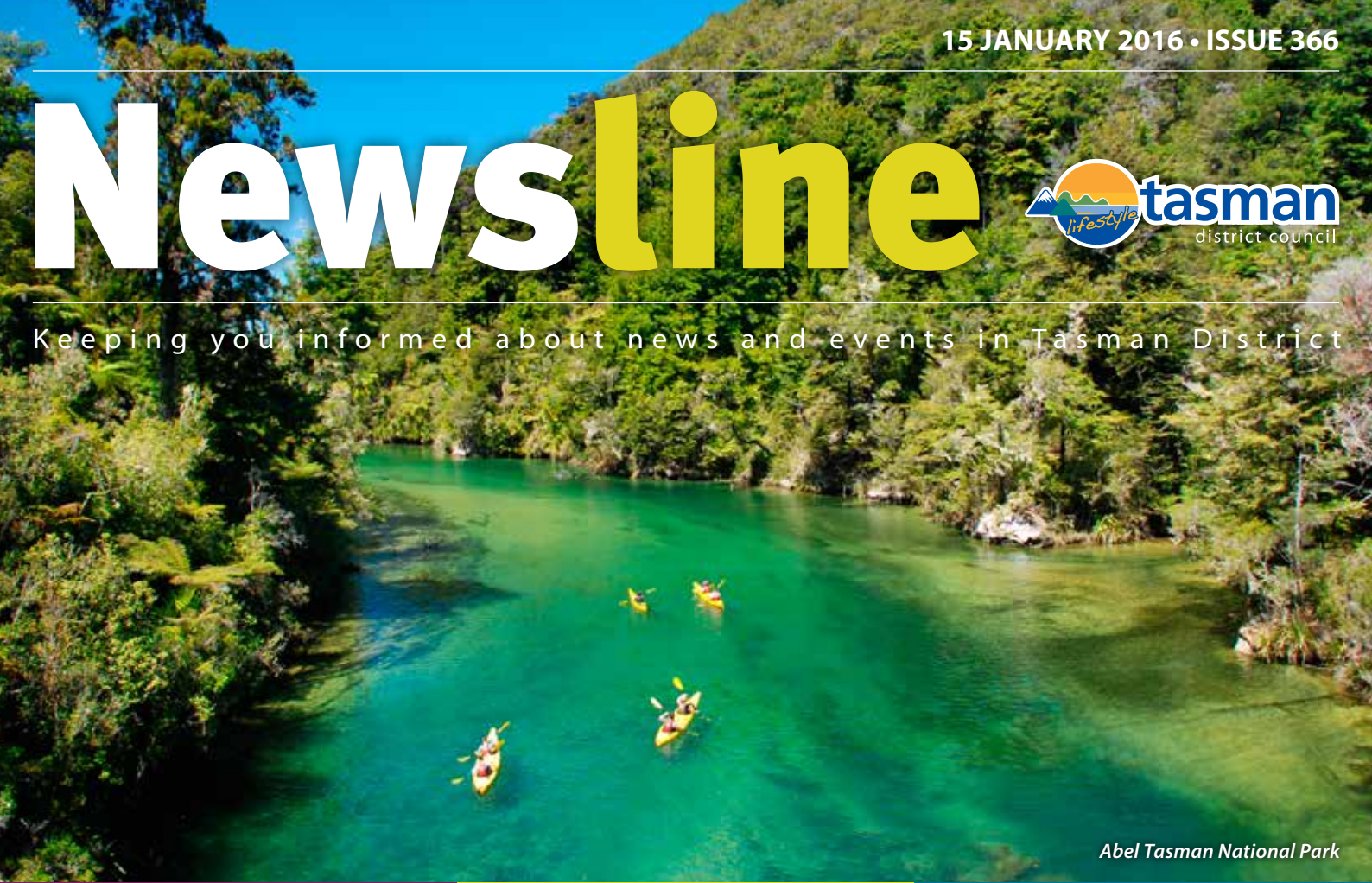
Abel Tasman National Park

Keeping you informed about news and events in Tasman District