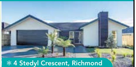
* 4 Stedyl Crescent, Richmond

2 & 4 Stedyl Crescent Richmond OPEN Monday to Friday 11.00am–4.00pm Saturday & Sunday 1.00pm–4.00pm