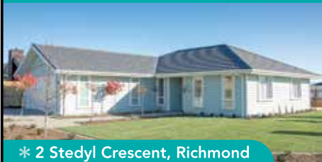
* 2 Stedyl Crescent, Richmond