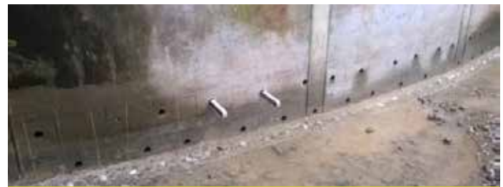
The inserted dowels.