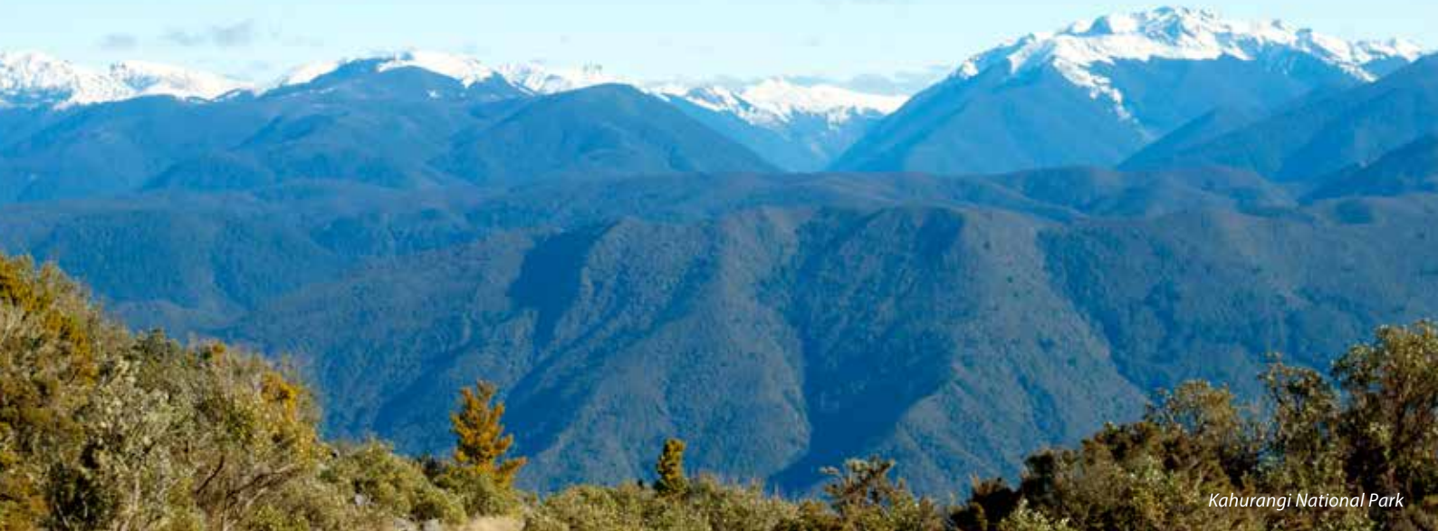
Kahurangi National Park

Keeping you informed about news and events in Tasman District