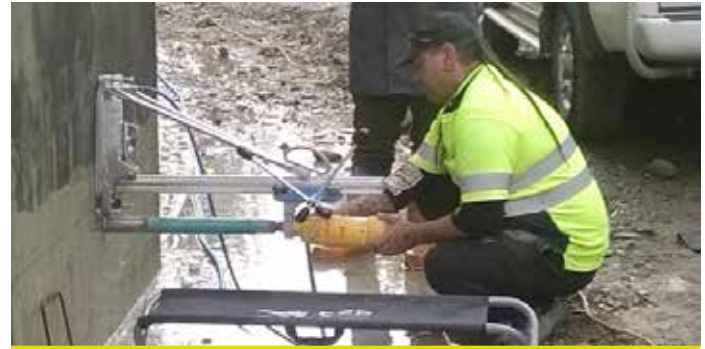
A contractor drilling holes into a concrete tank to insert metal dowels that will tie into the new concrete ring footing.

The main problem discovered is that the bottom of the tank walls are not secured to the floor slab, as under normal conditions, the weight and forces in the tank design keep the tank in place. However, during seismic events the direction of forces can change and the tank can fail. Council staff decided to reinforce the wall to floor connections in the three Richmond reservoirs and the work was carried out by Kidson Construction. The Project involves drilling hundreds of holes in the tank base to fit steel dowels, which are then fixed into the concrete ring beam.