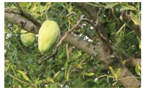
Mothplant ( Araujia hortorum )

Those interested in finding out more about the Accord can download the information from the Ministry for Primary Industries website at www.biosecurity.govt.nz/NPPA