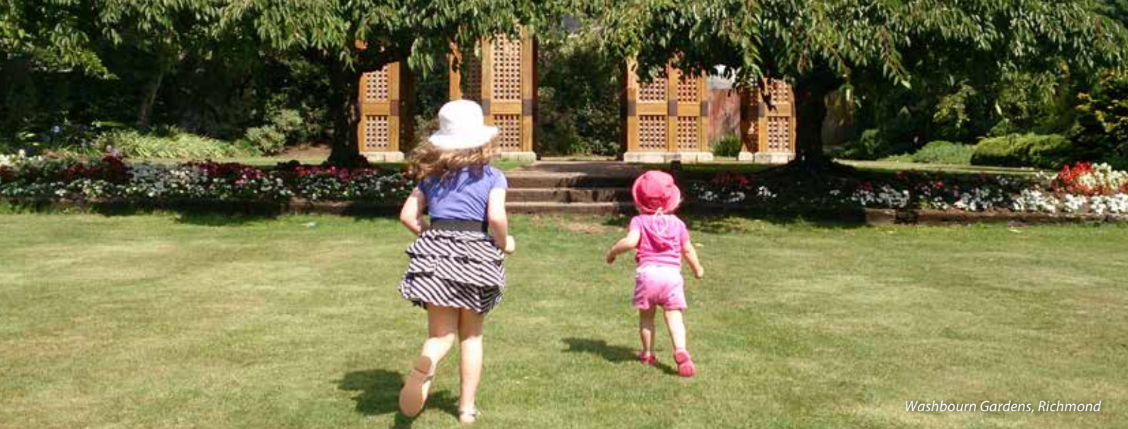
Washbourn Gardens, Richmond

Keeping you informed about news and events in Tasman District