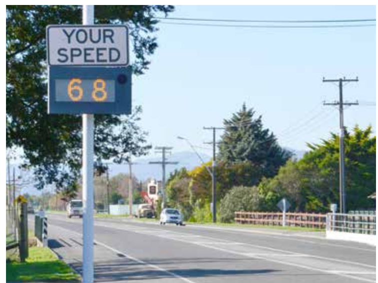
One of the current driver feedback signs located in Wakefield.

As they are solar powered the three signs will be used in different locations around the District with the first sites being Tapawera, Mapua and Richmond.