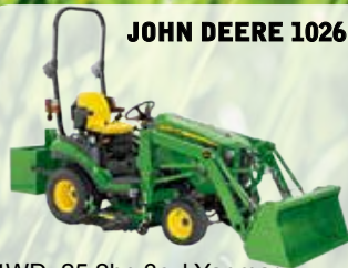
JOHN DEERE 1026R

4WD, 25.2hp 3cyl Yanmar Diesel, Hydrostatic transmission.