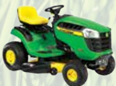
JOHN DEERE D100

17.5hp, 5-Speed gear transmission, 42" deck.