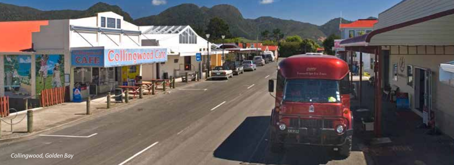
Collingwood, Golden Bay

Keeping you informed about news and events in Tasman District