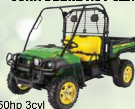
JOHN DEERE XUV 825i

4WD, 25.2hp 3cyl Yanmar Diesel, Hydrostatic transmission.