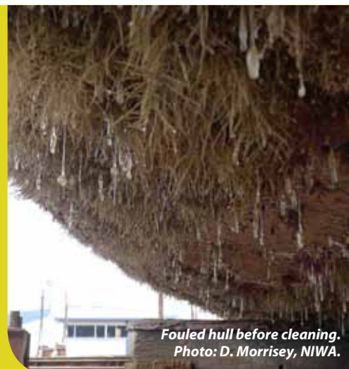
Fouled hull before cleaning.

The Top of the South Marine Biosecurity partnership is funded by the Tasman District