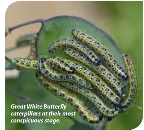
Great White Butterfly caterpillars at their most conspicuous stage.