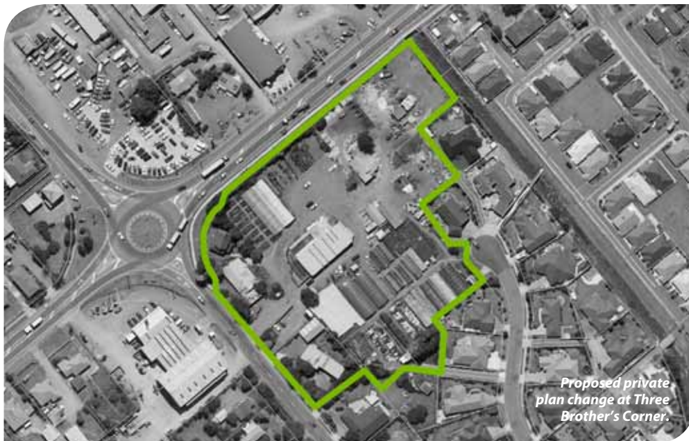
Proposed private plan change at Three Brother's Corner.