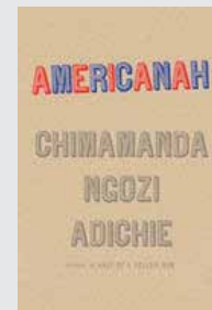
Americanah by Chimamanda Ngozi Adichie