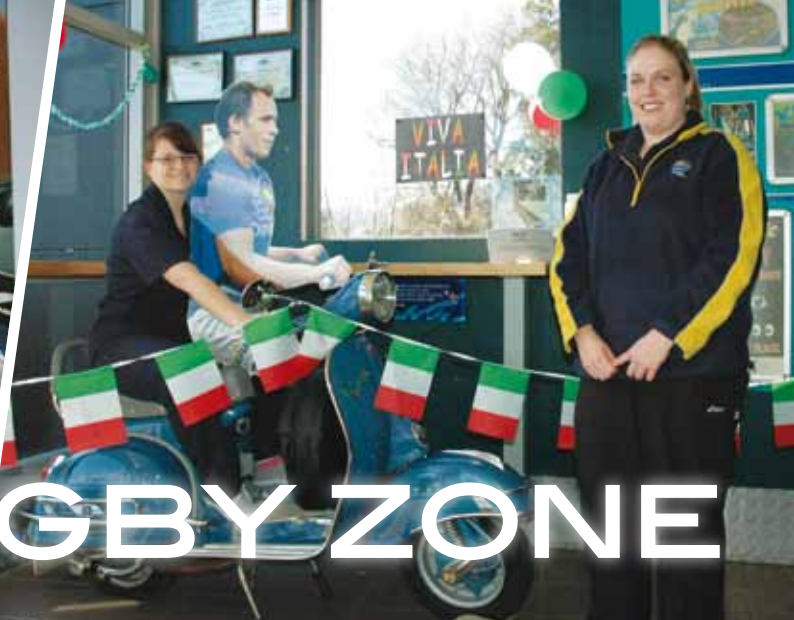
ASB Aquatic & Fitness Centre.