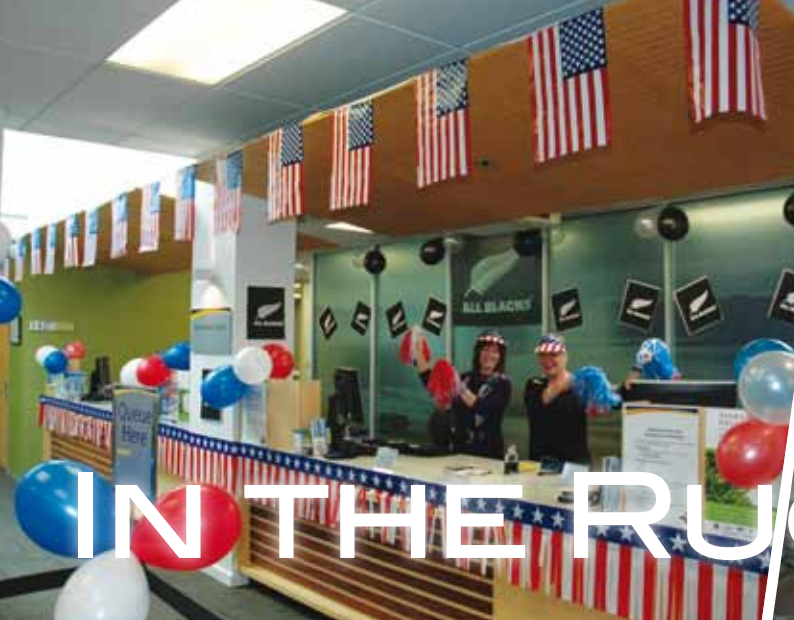
Council's Richmond office reception.