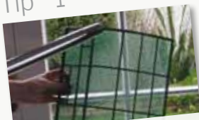
Some filters can be easily cleaned with a vacuum

Mitsubishi Electric Heat Pump filters are easily removed and cleaned. Simply vacuuming or washing in water will help them perform better and last longer.