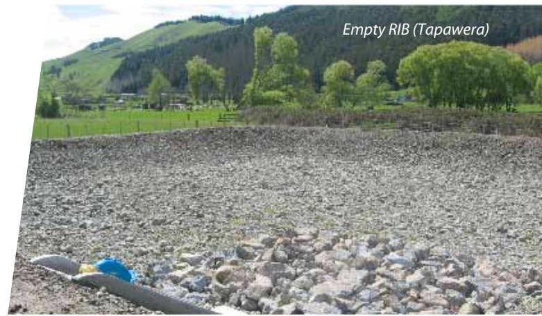
Empty RIB (Tapawera)

The work will include three individual infiltration tests. The first test will include distributing wastewater to a single RIB continuously over a 24-hour period. This test will essentially act as a "control" for the next two tests and will help identify any issues. Tests 2 and 3 will run continuously to measure the extent of water distribution under the RIB with certainty. This is expected to take about seven days per test. A resting period