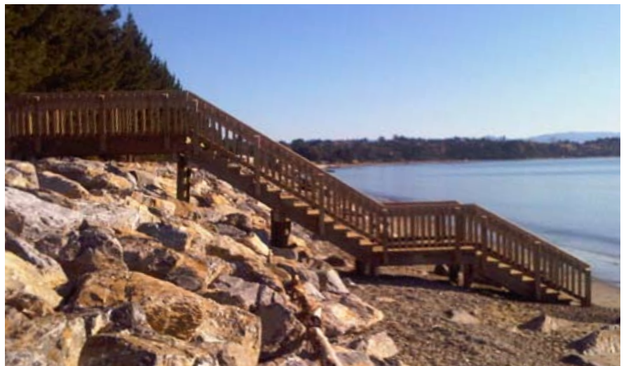
Holding the sea at bay.