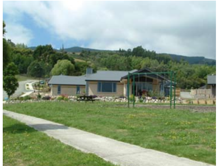
Richmond East hillslope from the park off Park & Highland Drives

Council is also requesting comment on two draft amendments updating the Tasman Resource Management Plan 'Active Fault Rupture Risk Management' and 'Slope Instability Risk' Area provisions.