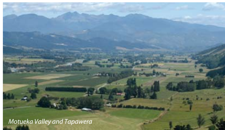
Motueka Valley and Tapawera