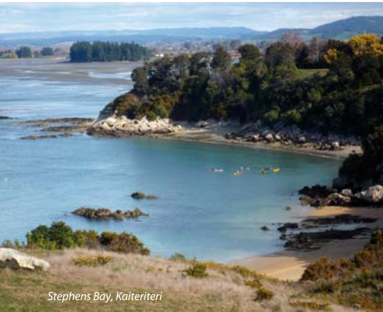
Stephens Bay, Kaiteriteri