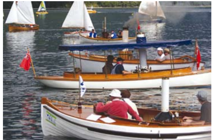
Old timers build up a head of steam on Rotoiti.

For further information go to www.itson.co.nz .