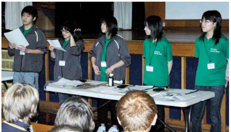
Kiyosato students give a presentation to Motueka High School students on their home town and culture.