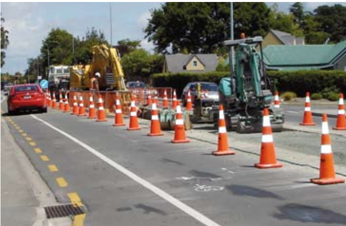
Work underway on Salisbury Road.