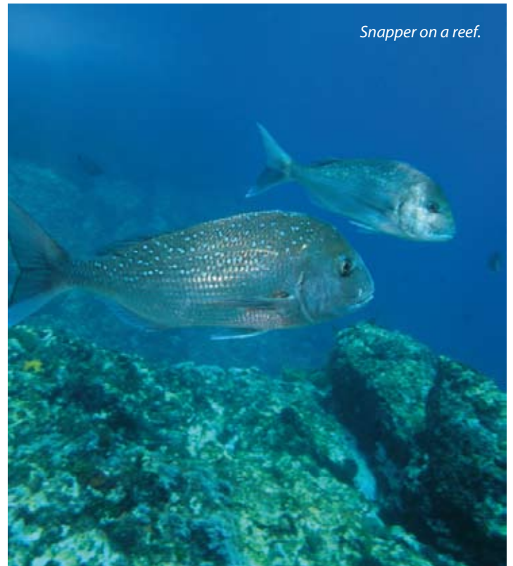
Snapper on a reef.

For further information contact Rudy Tetteroo at DOC Motueka, Ph. 03 528 1810 or contact Aquataxi for bookings Ph. 0800 278 282.