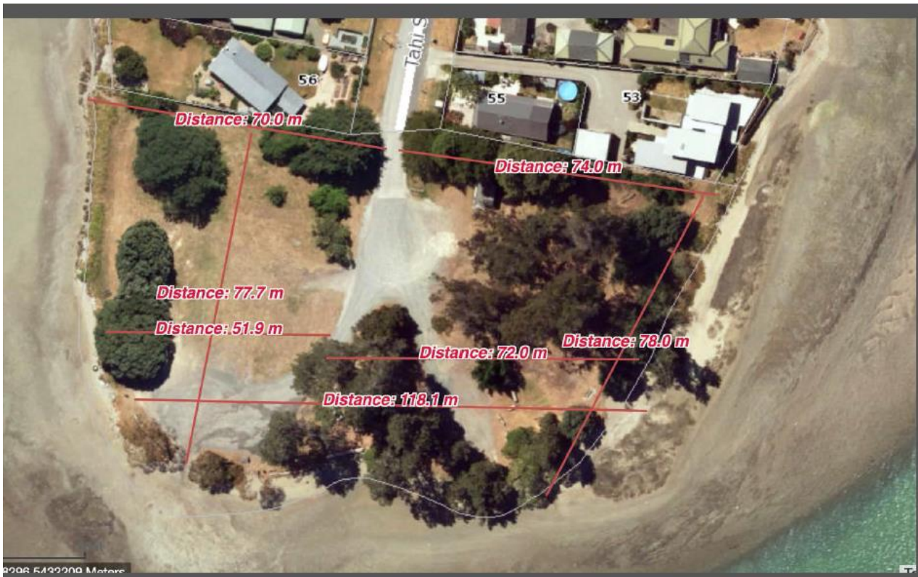
Appendix 3: Grossi Point map – top of south.