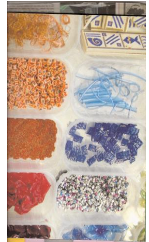
Art materials (Remida DAY: changing minds)

Early childhood education centres on the Small Planet programme last year requested we set up an exchange for arts and crafts materials. Now, a small house at Nelson Environment Centre is cleaned and ready to receive materials suitable for exchange. The exchange day will be the third Wednesday of each month at 3-5pm, with 22 Feb the starting date. Initially for early childhood centres, we hope to extend membership to other interested parties as soon as we are fully established. A $15 per year membership fee applies. We welcome any spare shelves, great materials and enthusiasm!