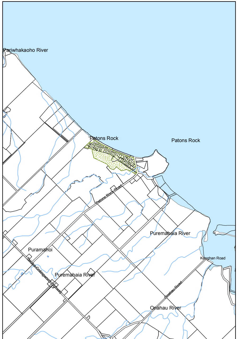
Map 243B: Patons Rock