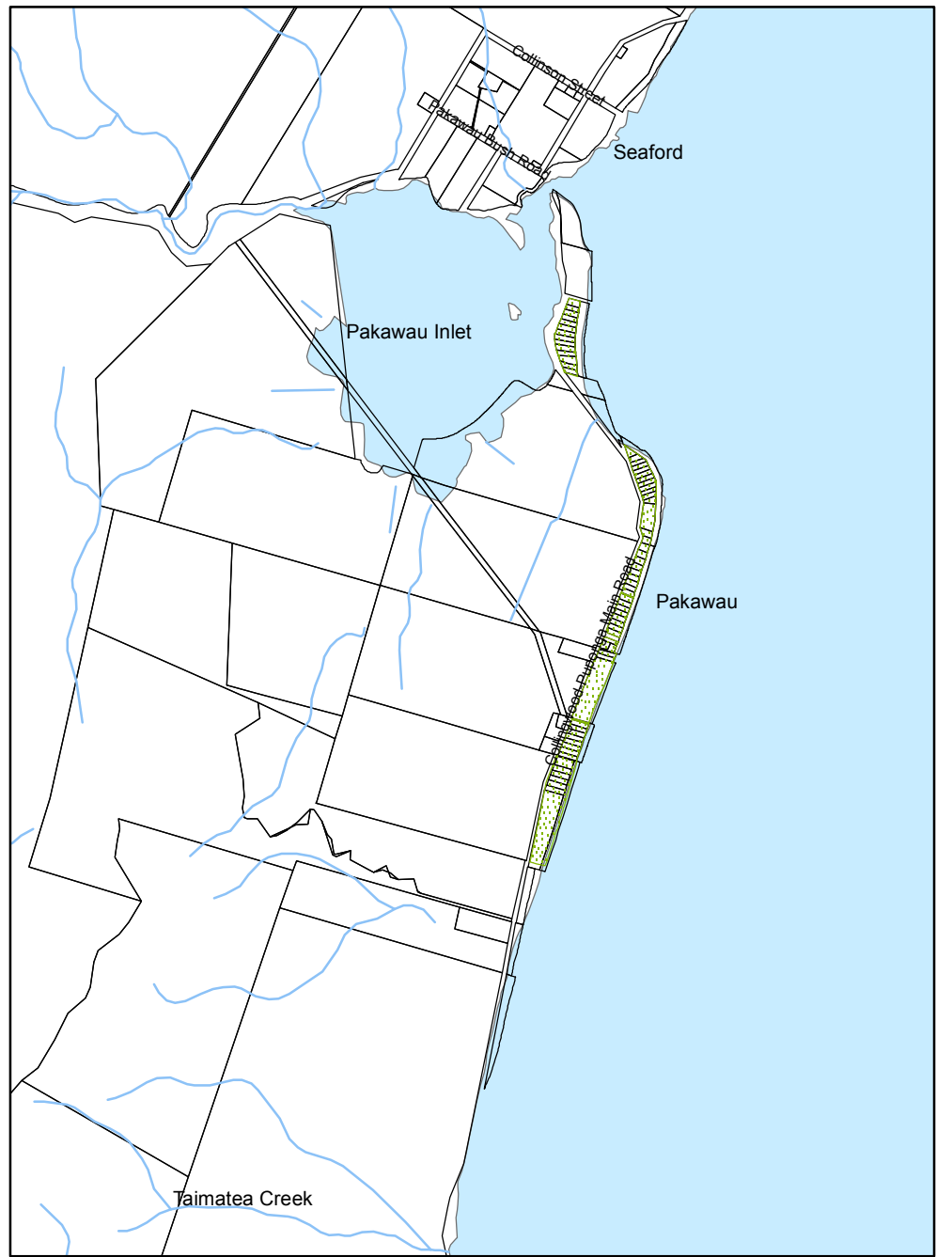
Map 242B: Pakawau