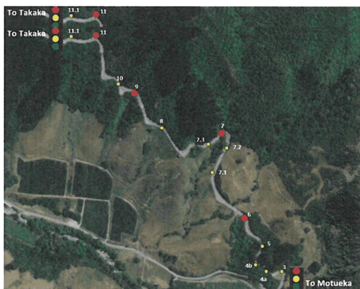
Map showing location of minor sites (yellow) and major sites (red)

The NZ Transport Agency's Tasman Journeys' team has made great progress on the 10 minor slip sites on Takaka Hill, with work at these sites nearing completion. Construction at the five more significantly damaged sites is due to start soon. Engineering consultants Beca, commissioned by the Transport Agency, have been designing the repairs to these sites in recent months. These will include reinstating the road using reinforced earth retaining walls and rock filled facing.