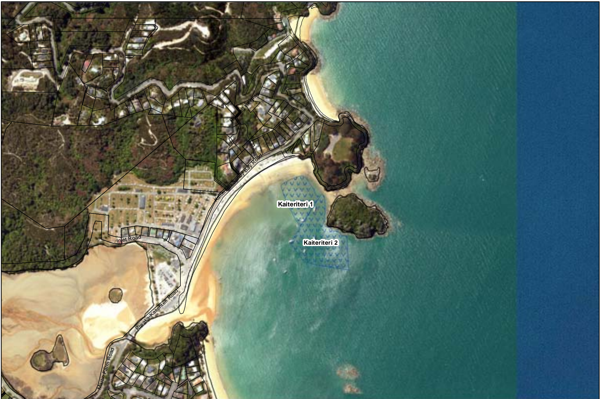
Map 180D: Kaiteriteri Mooring Areas Update Map 64/6 20 June 2020 Map affected: 180