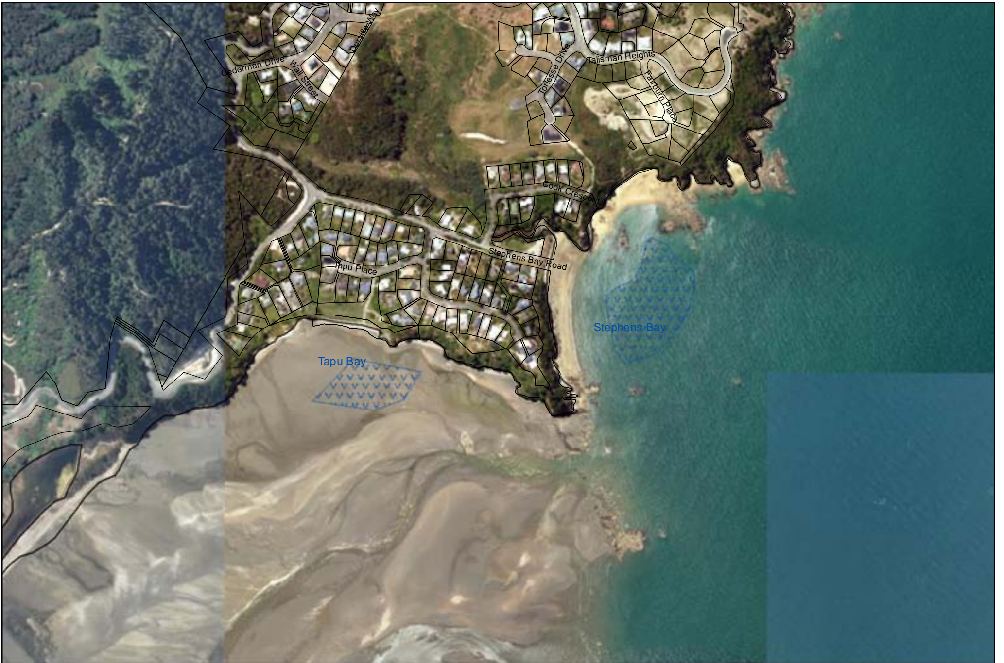
Map 180C: Tapu Bay - Stephens Bay