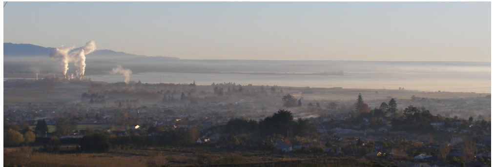
Richmond on a smoggy morning in June 2007

For a full report on Air Quality see the Council website: www.tasman.govt.nz click on "Environment" pages, then click "Air" or use the following link: http://www.tasman.govt.nz/index.php?Air