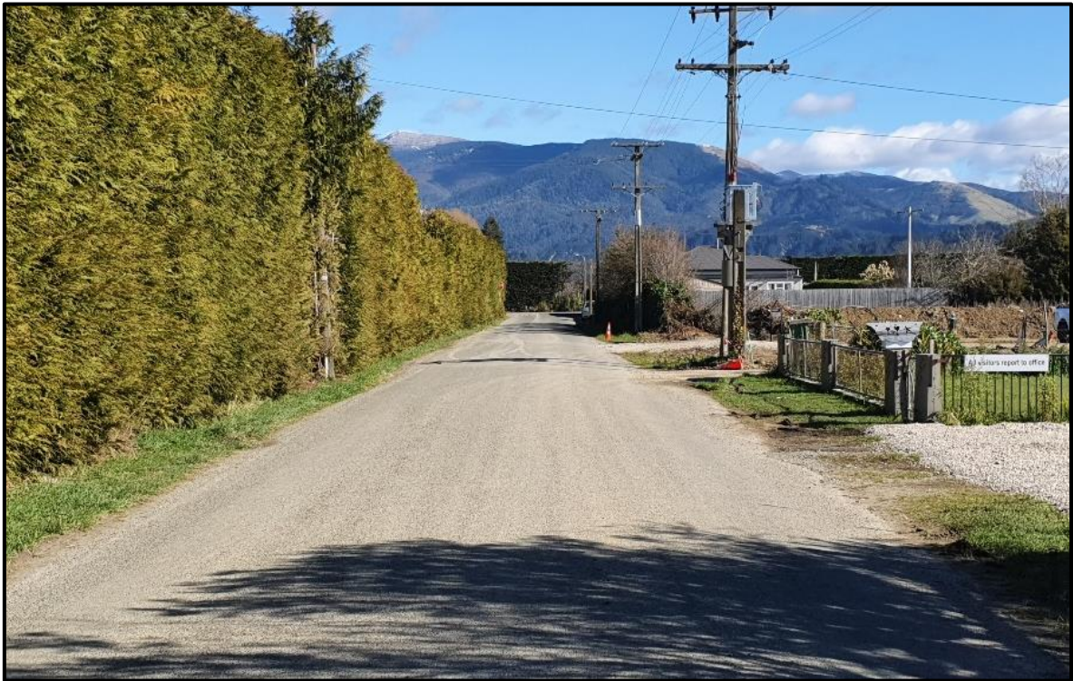
Figure 3: Road Environment

Figure 3 shows the road environment along Green Lane.