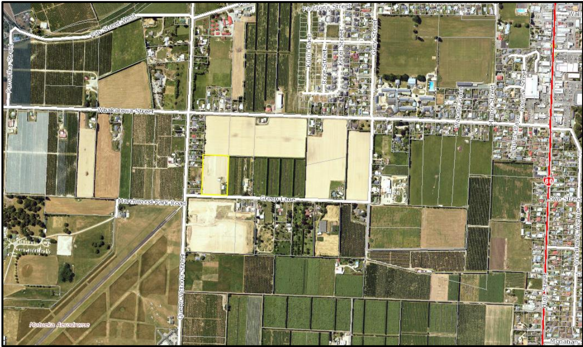
Figure 1: Site Location

As shown, the site is located on the northern side of Green Lane around 100 metres from the intersection of Green Lane and Queen Victoria Street.