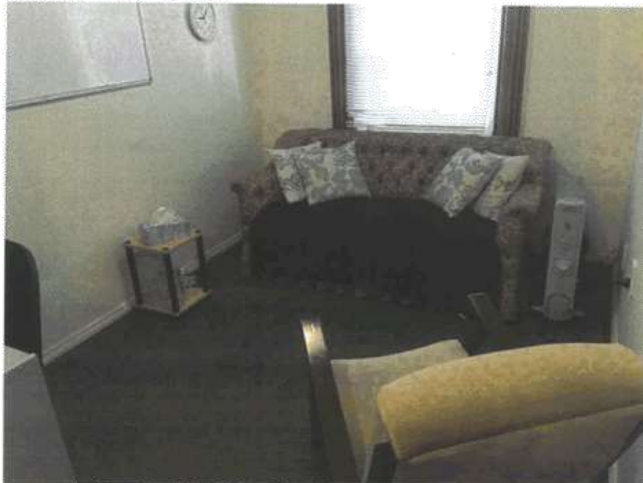
Our Counselling room before