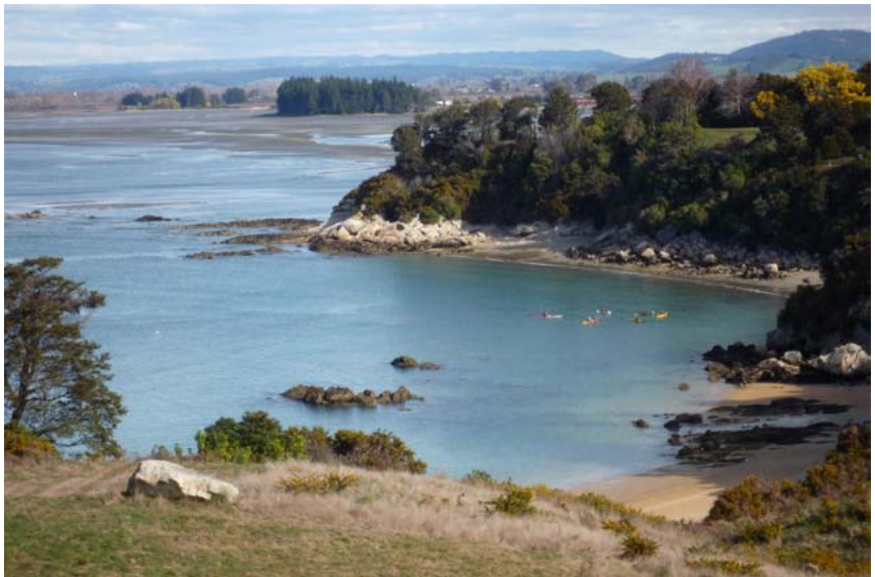
Stephens Bay, Kaiteriteri