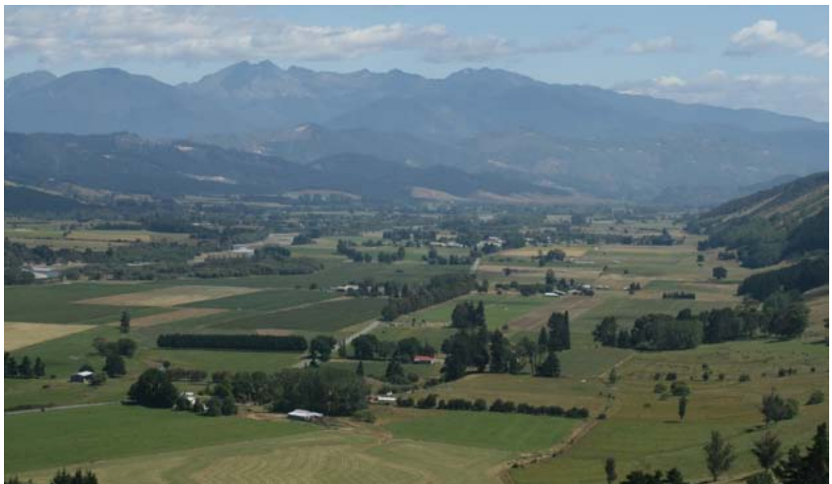
Motueka Valley and Tapawera