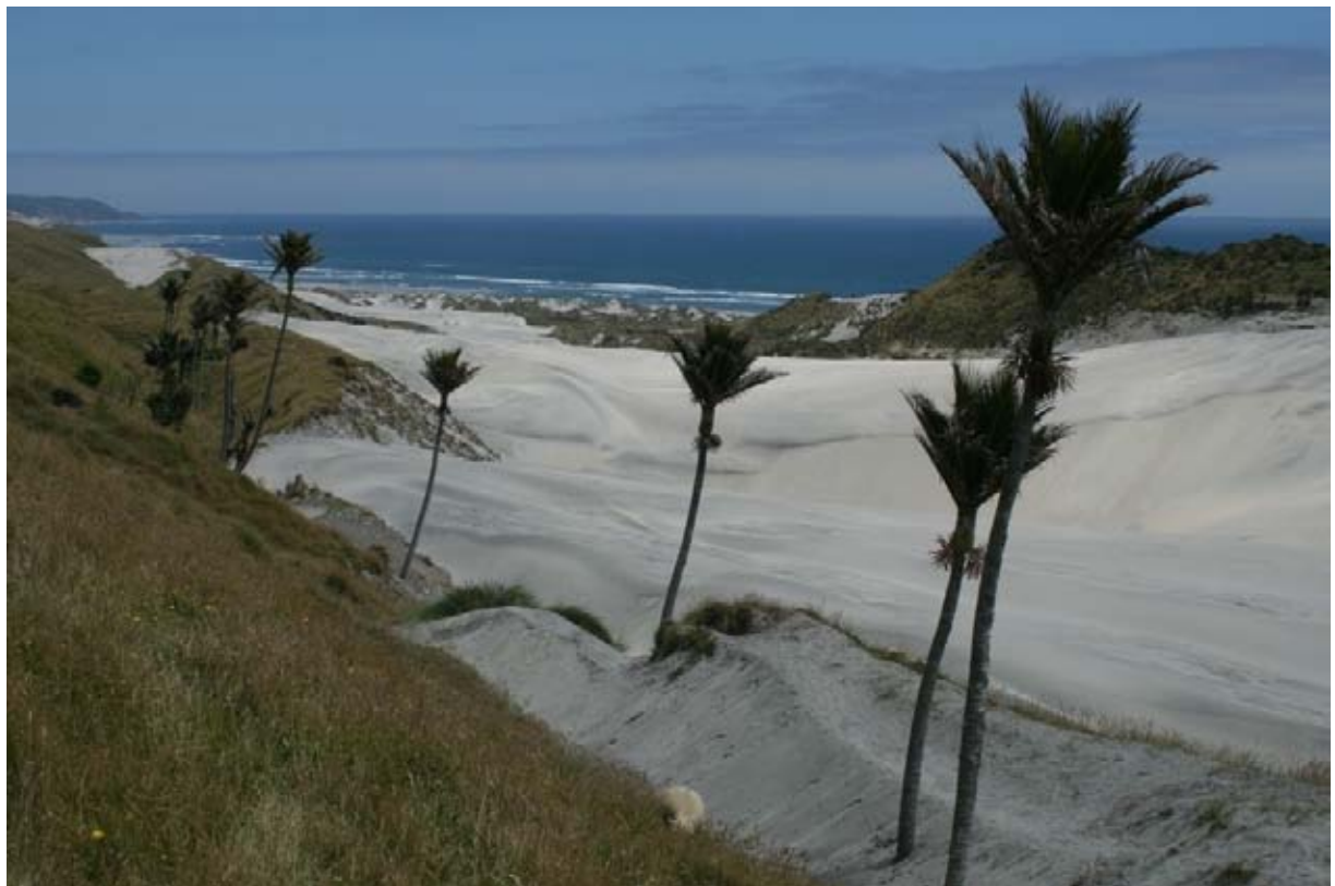
Turimawiwi sandhills, Golden Bay